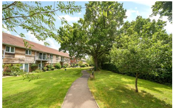
LOCAL AUTHORITY Test Valley Borough Council Council Tax Band D