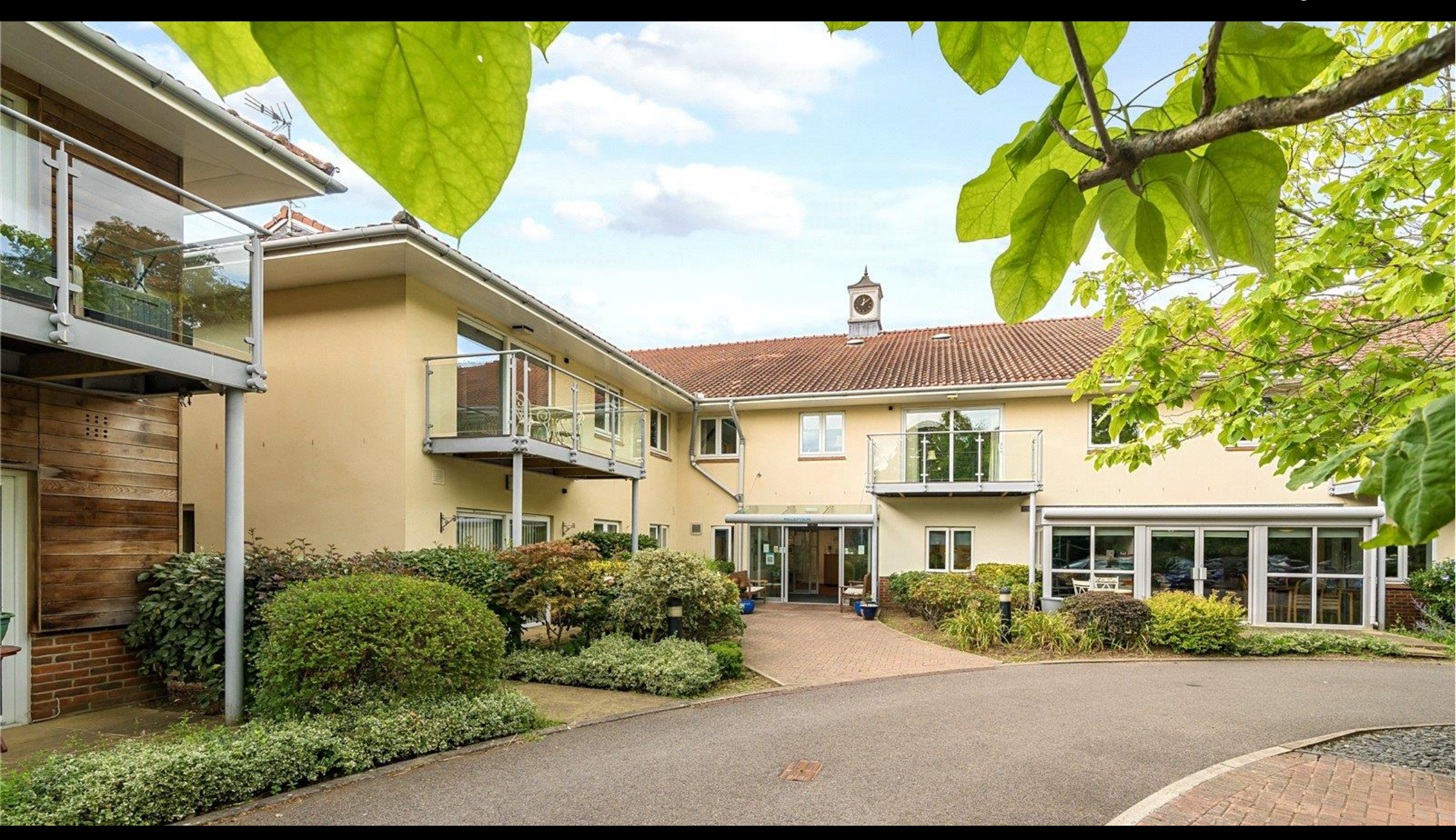
Knightwood Mews, Shannon Way, Chandler's Ford, Hampshire, SO53 4TL