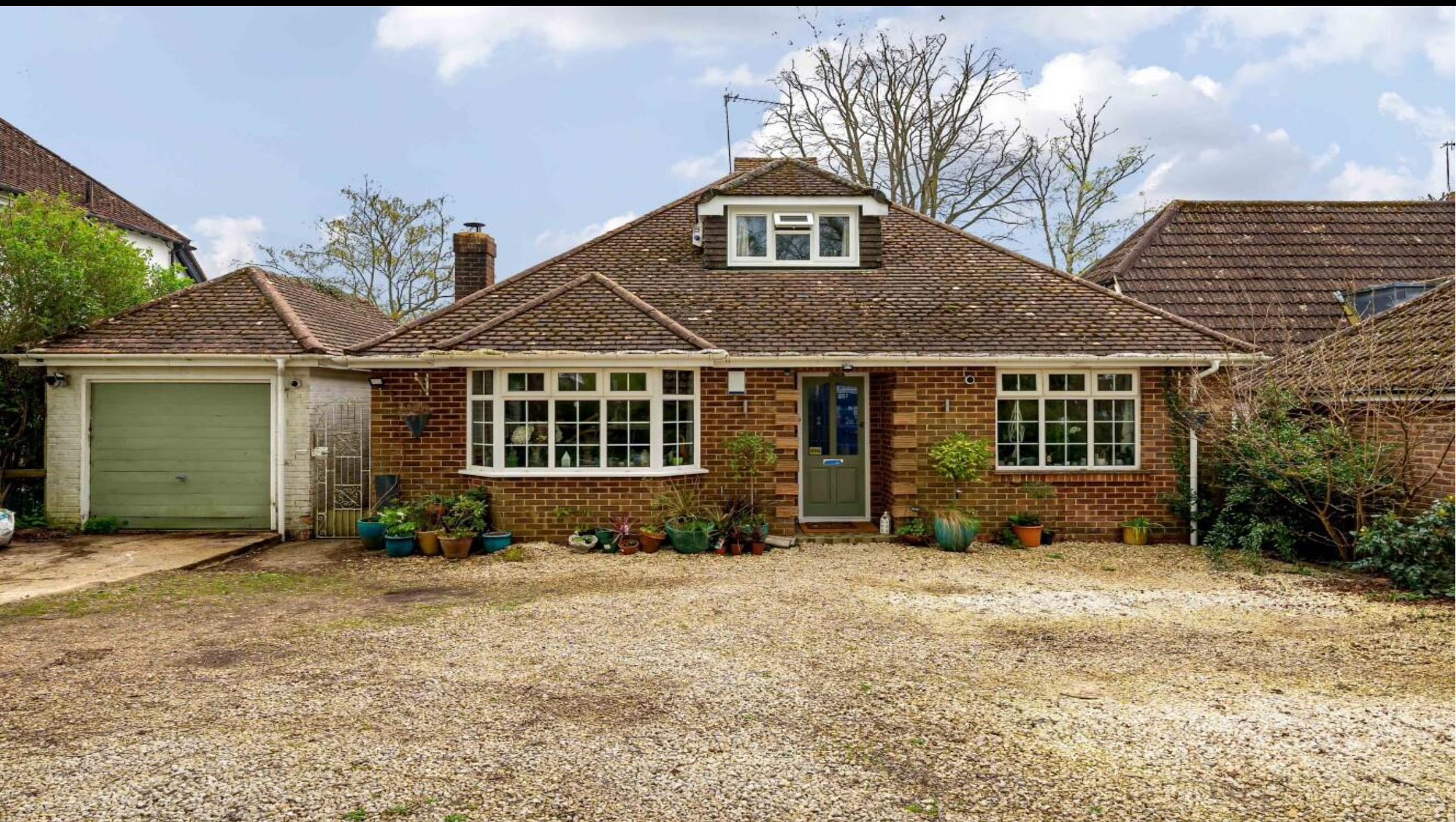
Kingsway, Hiltingbury, Chandler's Ford, Hampshire, SO53 5BX