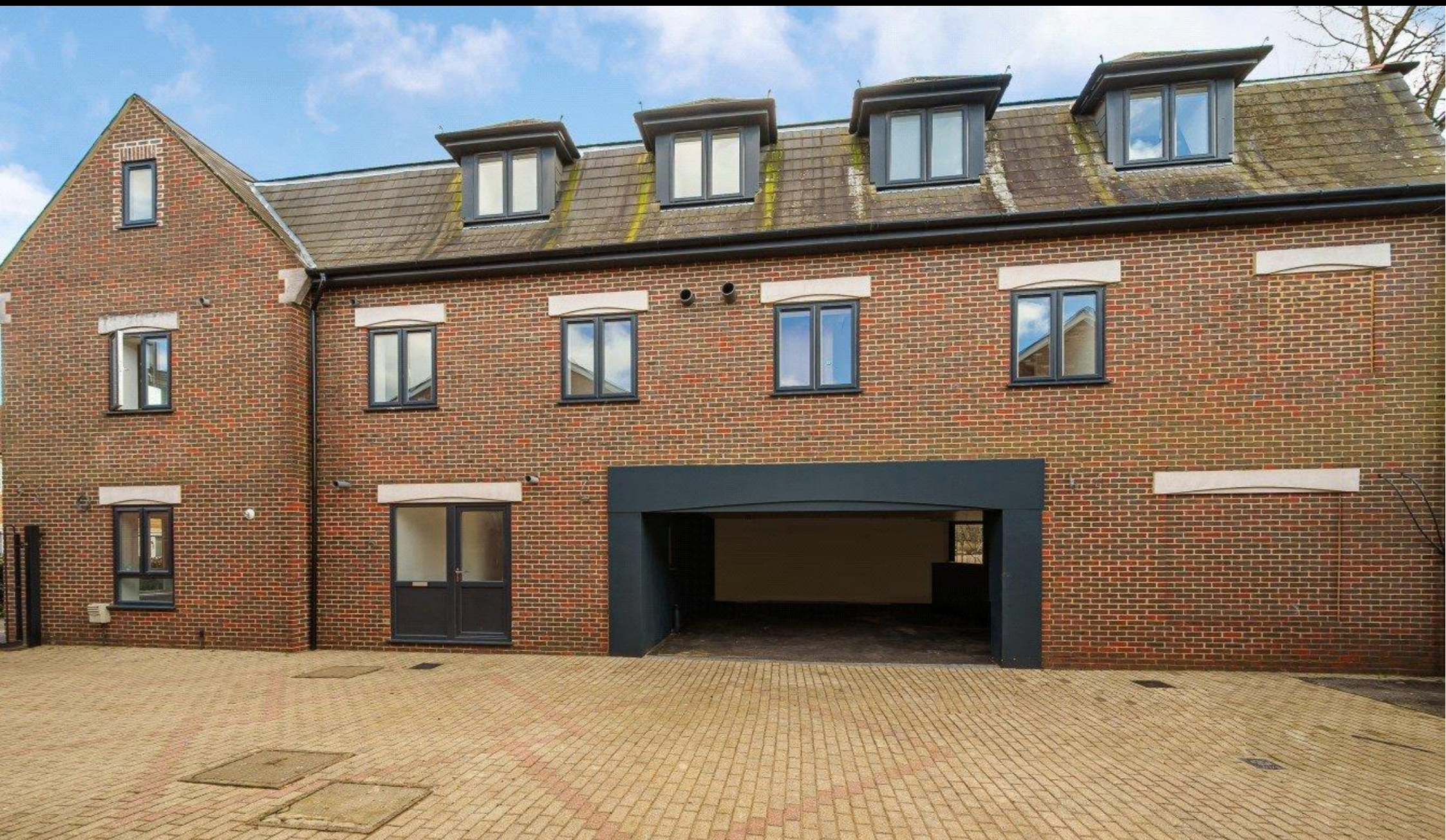
Normandy House, Nether Street, Alton, Hampshire, GU34 1EA