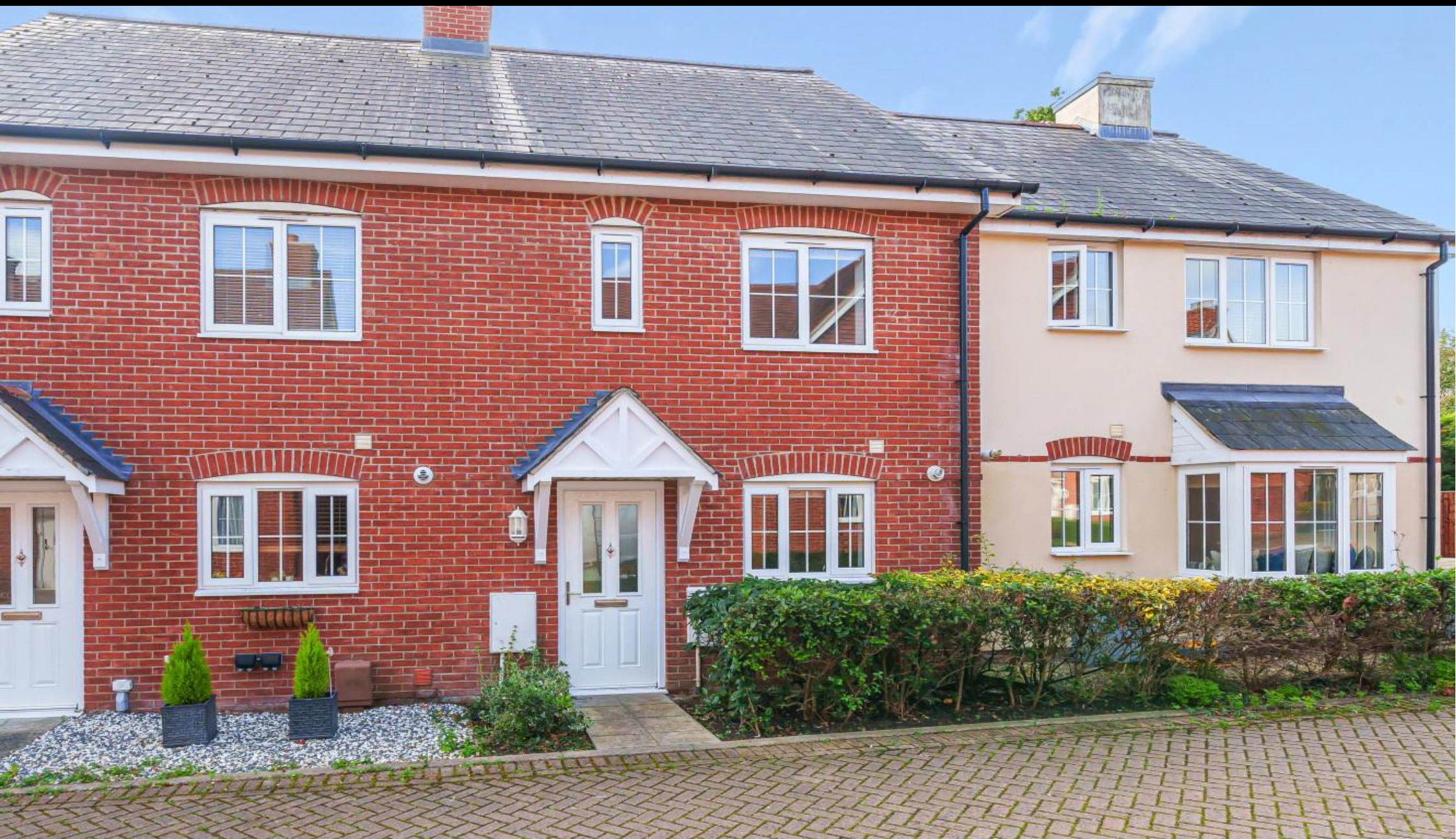
Franklyn Close, Waltham Chase, Southampton, Hampshire, SO32 2FH