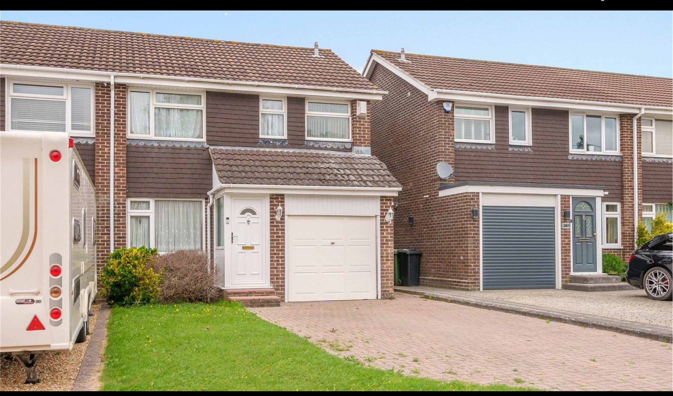
Fair Oak Road, Bishopstoke, Eastleigh, Hampshire, SO50 8JU