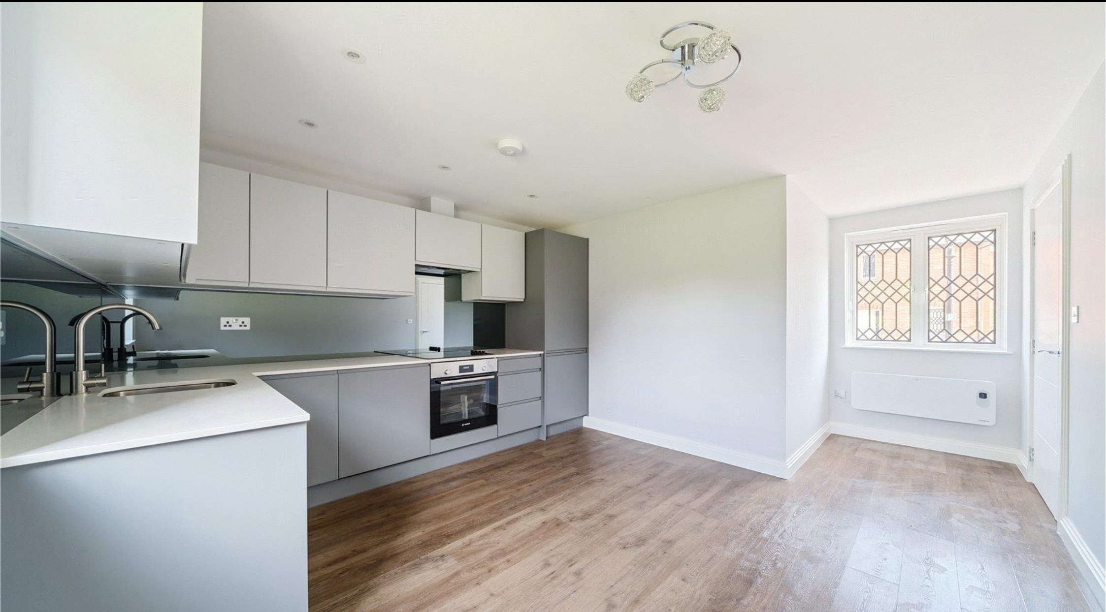
Carlton House, Forest View, Ringwood Road, Woodlands, Hampshire, SO40 7HT