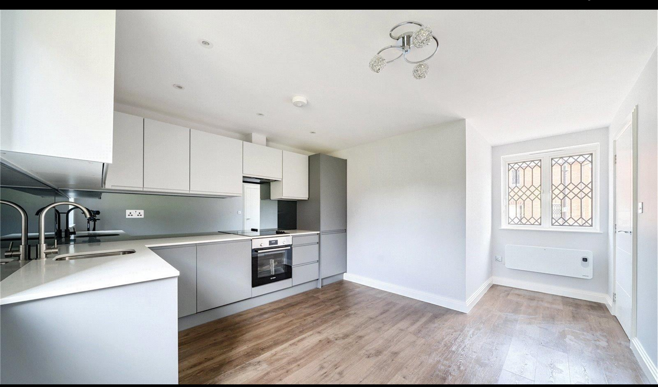
Forest View, Ringwood Road, Woodlands, Hampshire, SO40 7HT