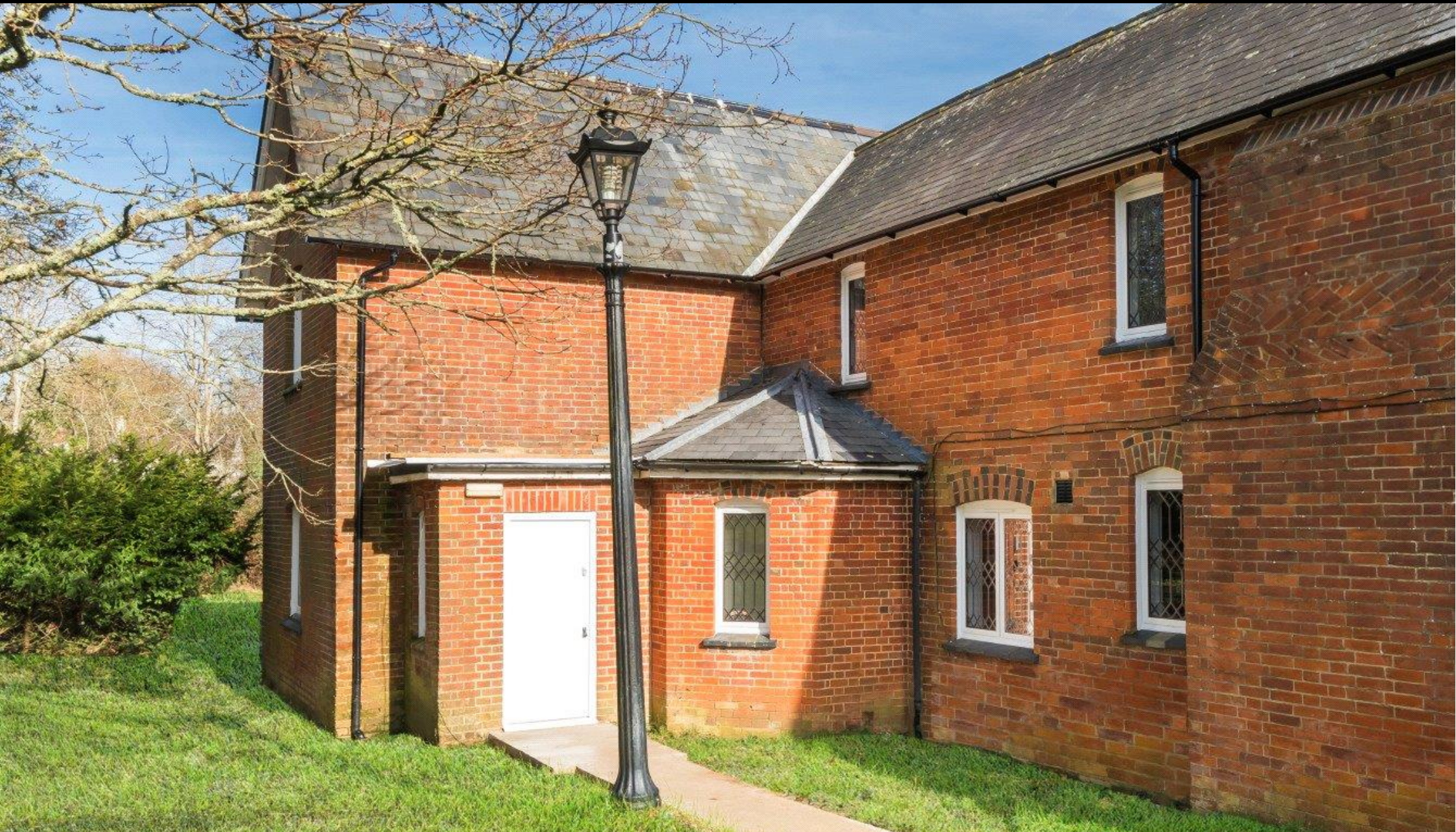
Forest View, Ringwood Road, Woodlands, Hampshire, SO40 7HT