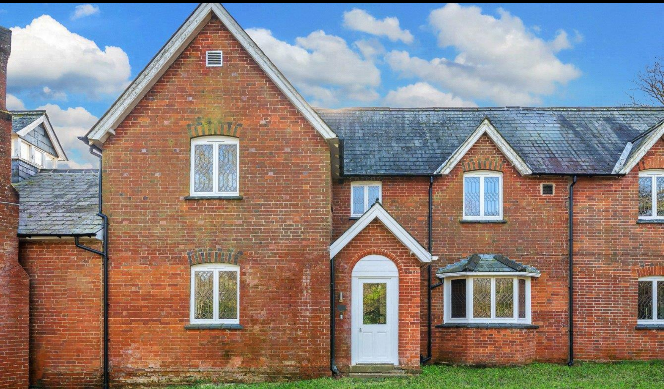
Forest View, Ringwood Road, Woodlands, Hampshire, SO40 7HT