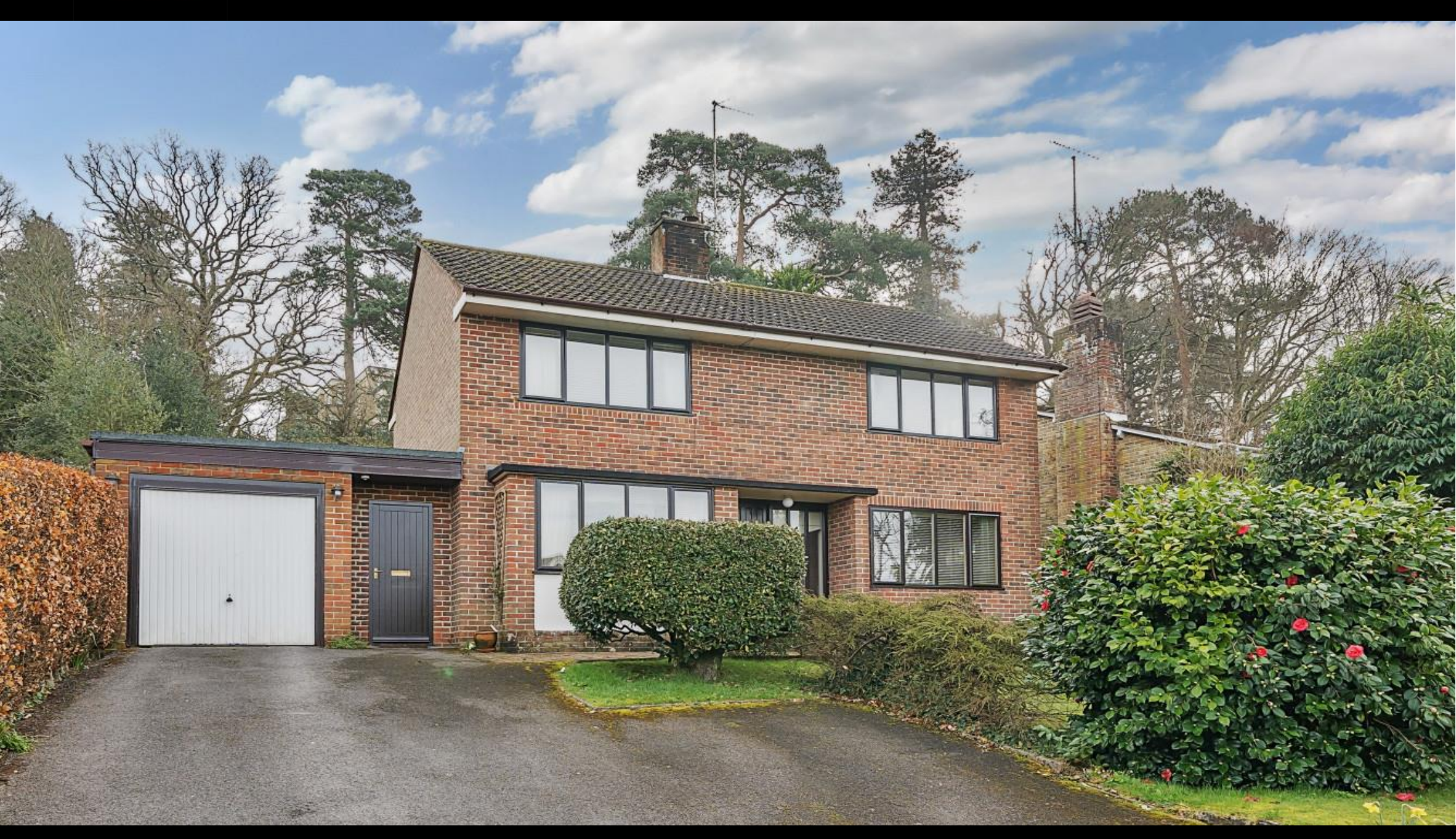
Holly Hill, Bassett, Southampton, Hampshire, SO16 7ES