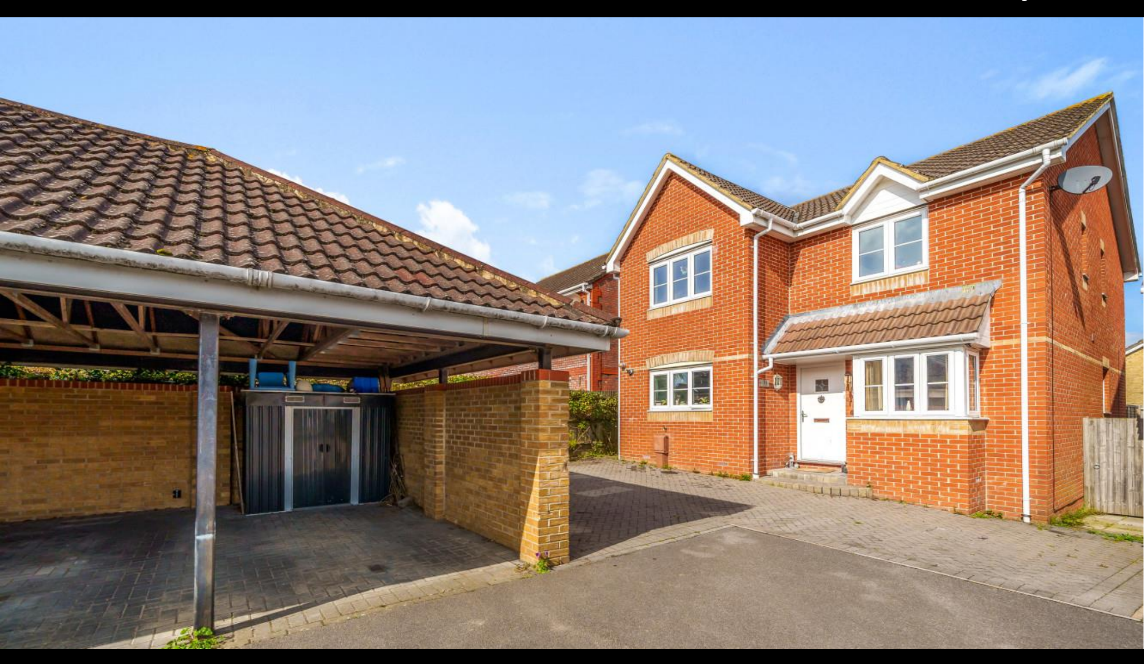
Park Cottage Drive, Fareham, Hampshire, PO15 5JD