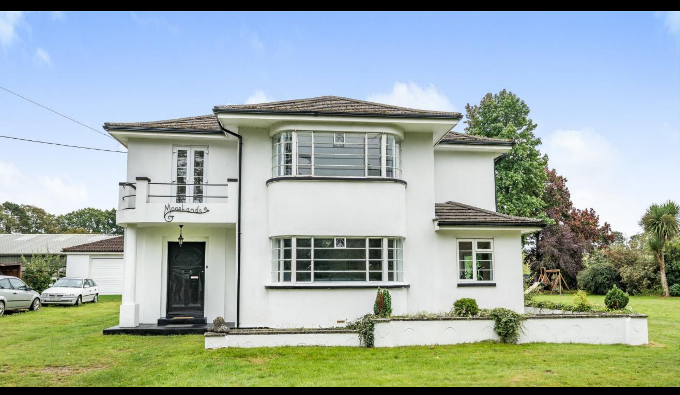
Romsey Road, Copythorne, Southampton, Hampshire, SO40 2PB