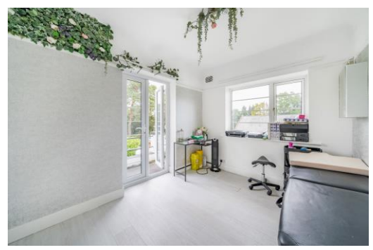
LOCAL AUTHORITY New Forest District Cou

New Forest District Council Council Tax Band F