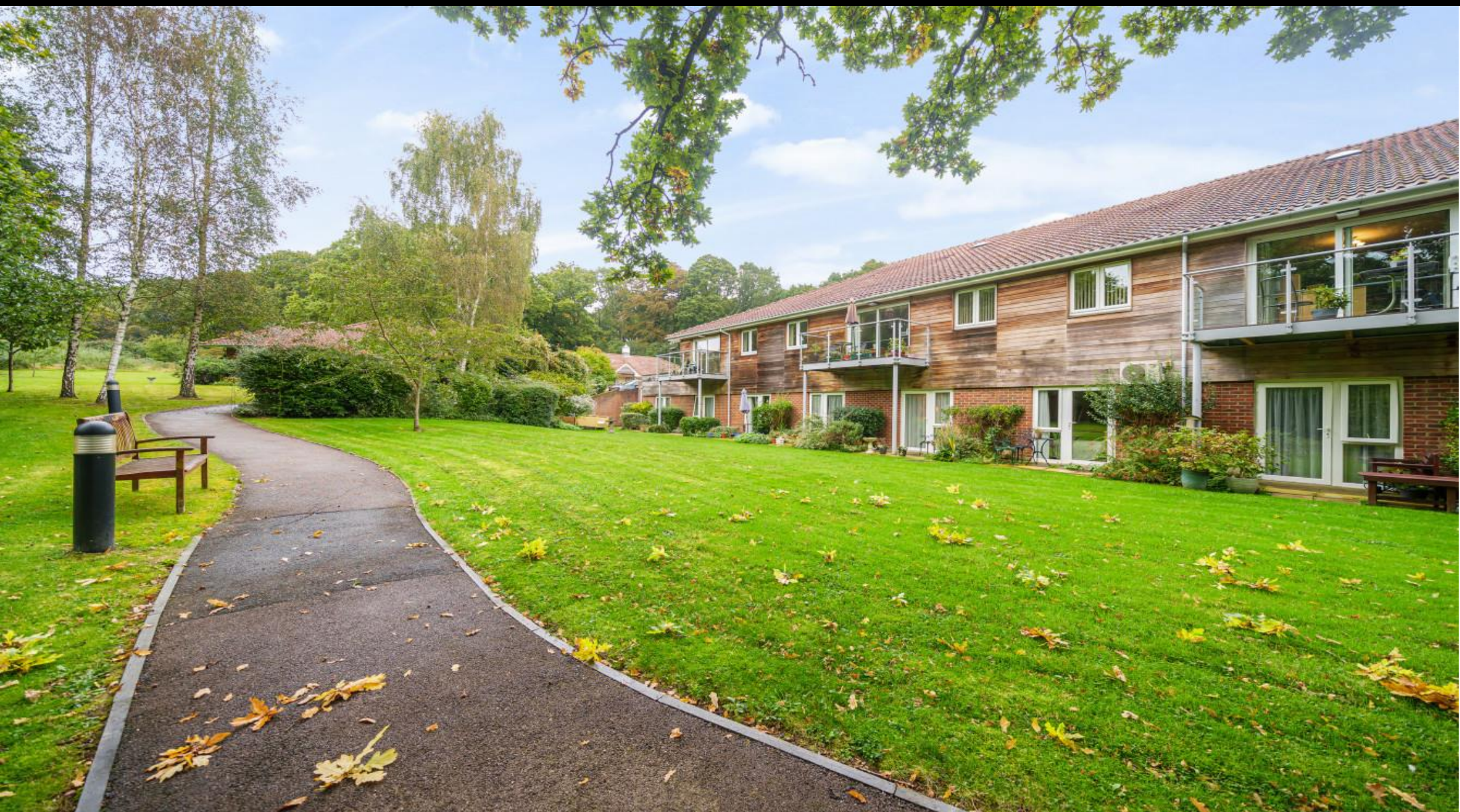
Knitwood Mews, Shannon Way, Chandler's Ford, Eastleigh, Hampshire, SO53 4TL