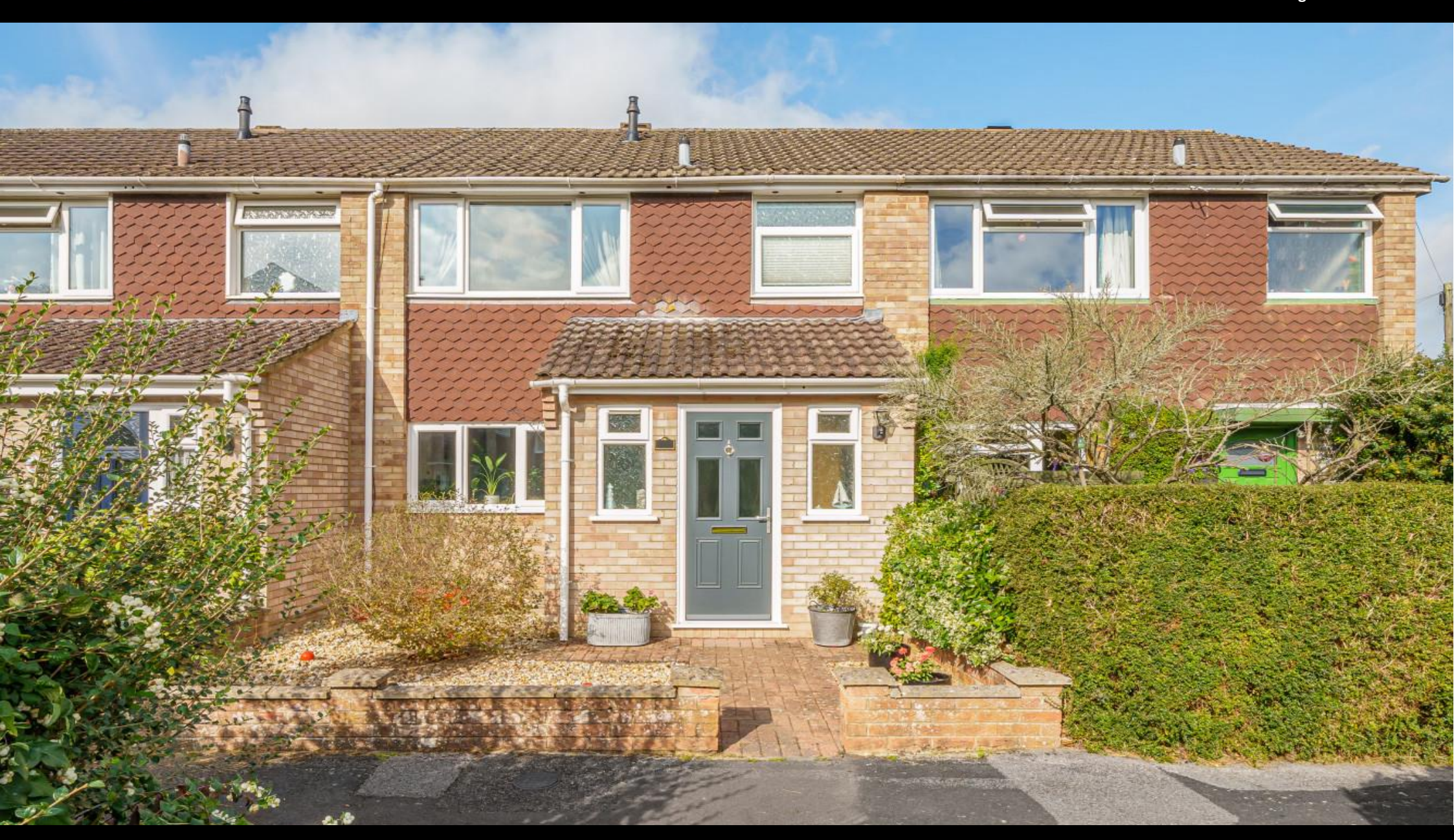
Sutherland Close, Romsey, Hampshire, SO5 | 7TH