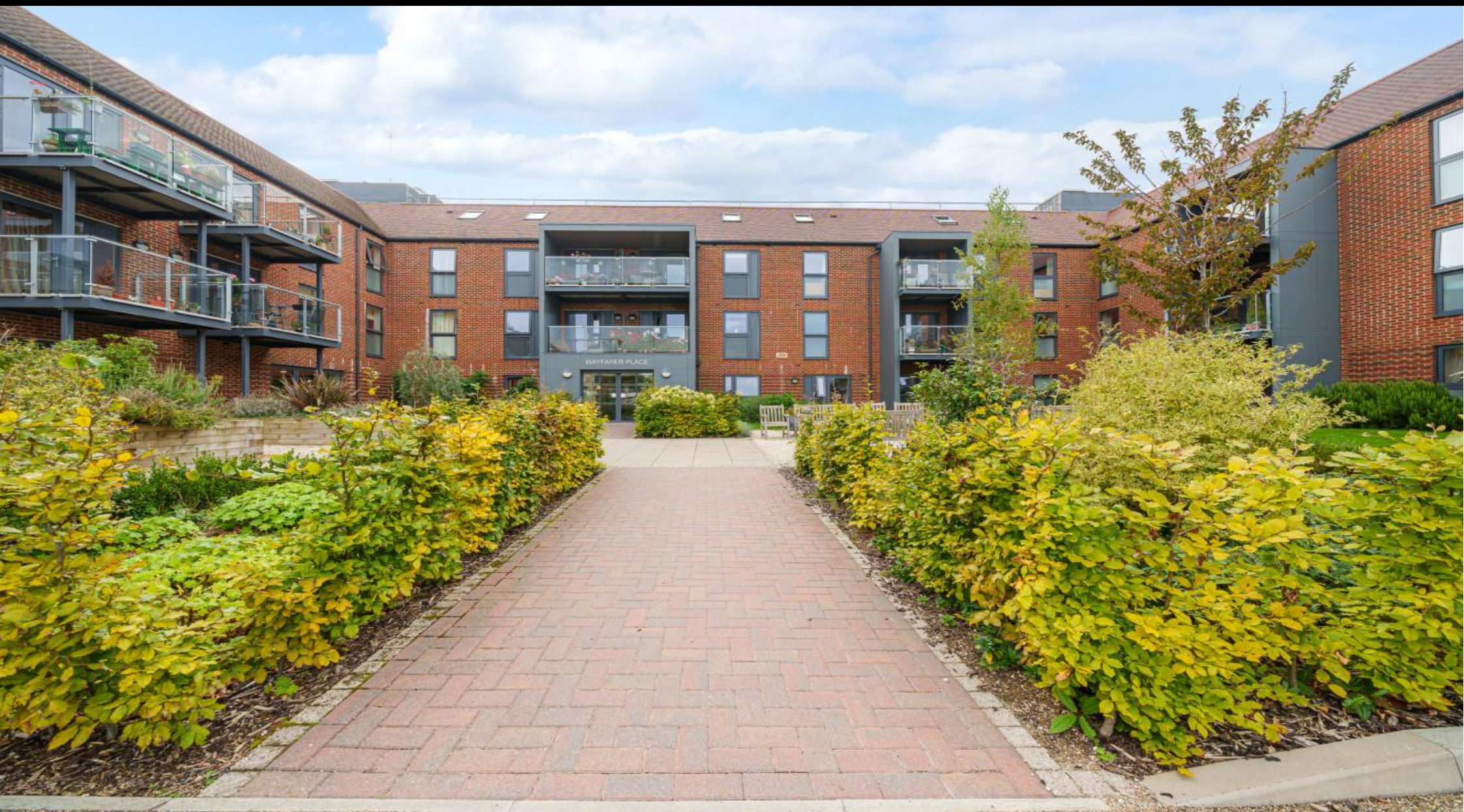
Wayfarer Place, The Dean, Alresford, Hampshire, SO24 9FT