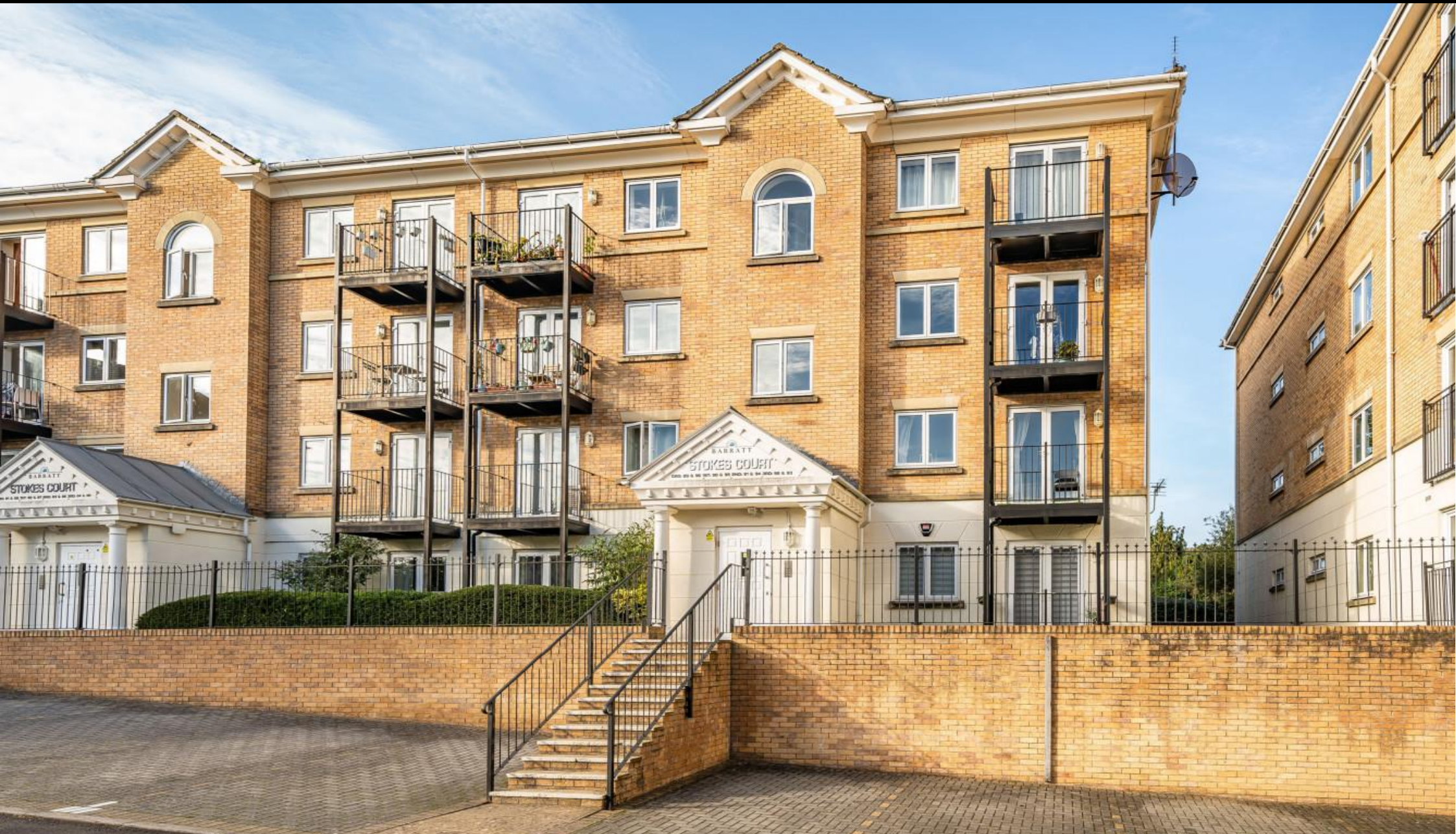
Stokes Court, The Dell, Southampton, Hampshire, SO15 2PR