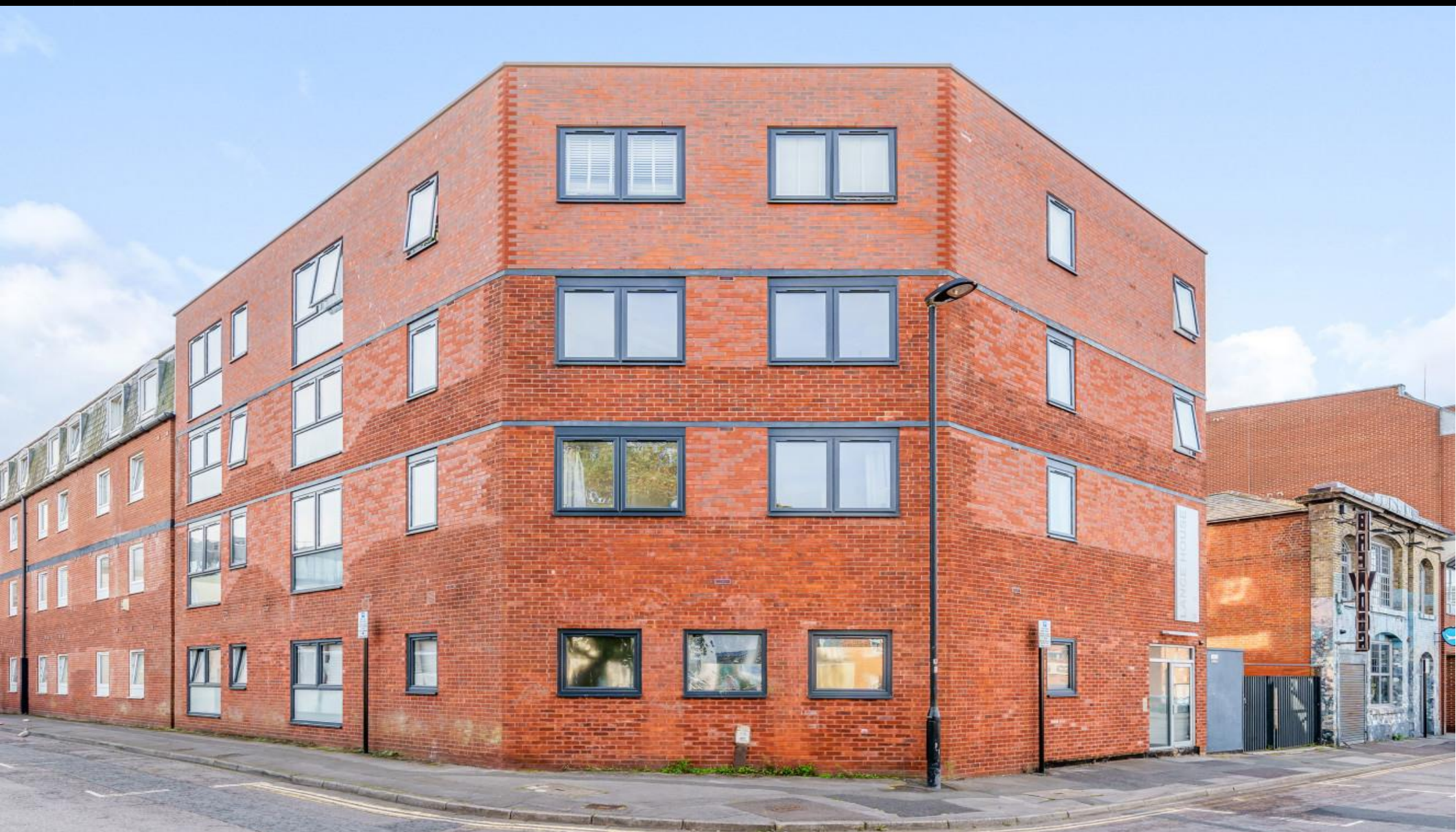
Lance House 16-18, Upper Banister Street, Southampton, Hampshire, SO15 2EF