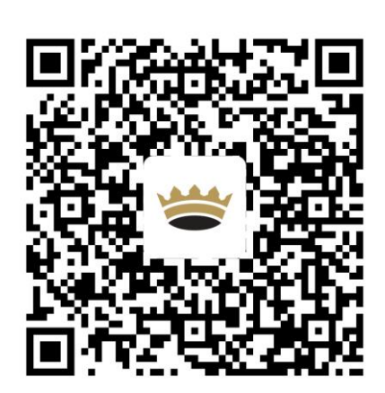
Scan the QR code to find out more information about this property.

Disclaimer Property Details: These particulars, whilst believed to be accurate are set out as a general outline only for guidance and do not constitute any part of an offer or contract. Intending purchasers should not rely on them as statements or representation of fact, but must satisfy themselves by inspection or otherwise as to their accuracy. We have not carried out a detailed survey nor tested the services, appliances and specific fittings. Room sizes should not be relied upon for carpets and furnishings. The measurements given are approximate. No person in this firms' employment has the authority to make or give any representation or warranty in respect of the property.