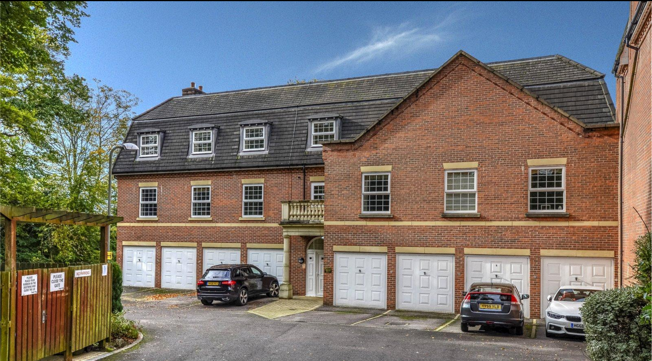
Newitt Place, Bassett, Southampton, Hampshire, SO16 7FA