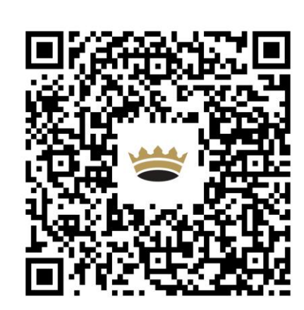
Scan the QR code to find out more information about this property.