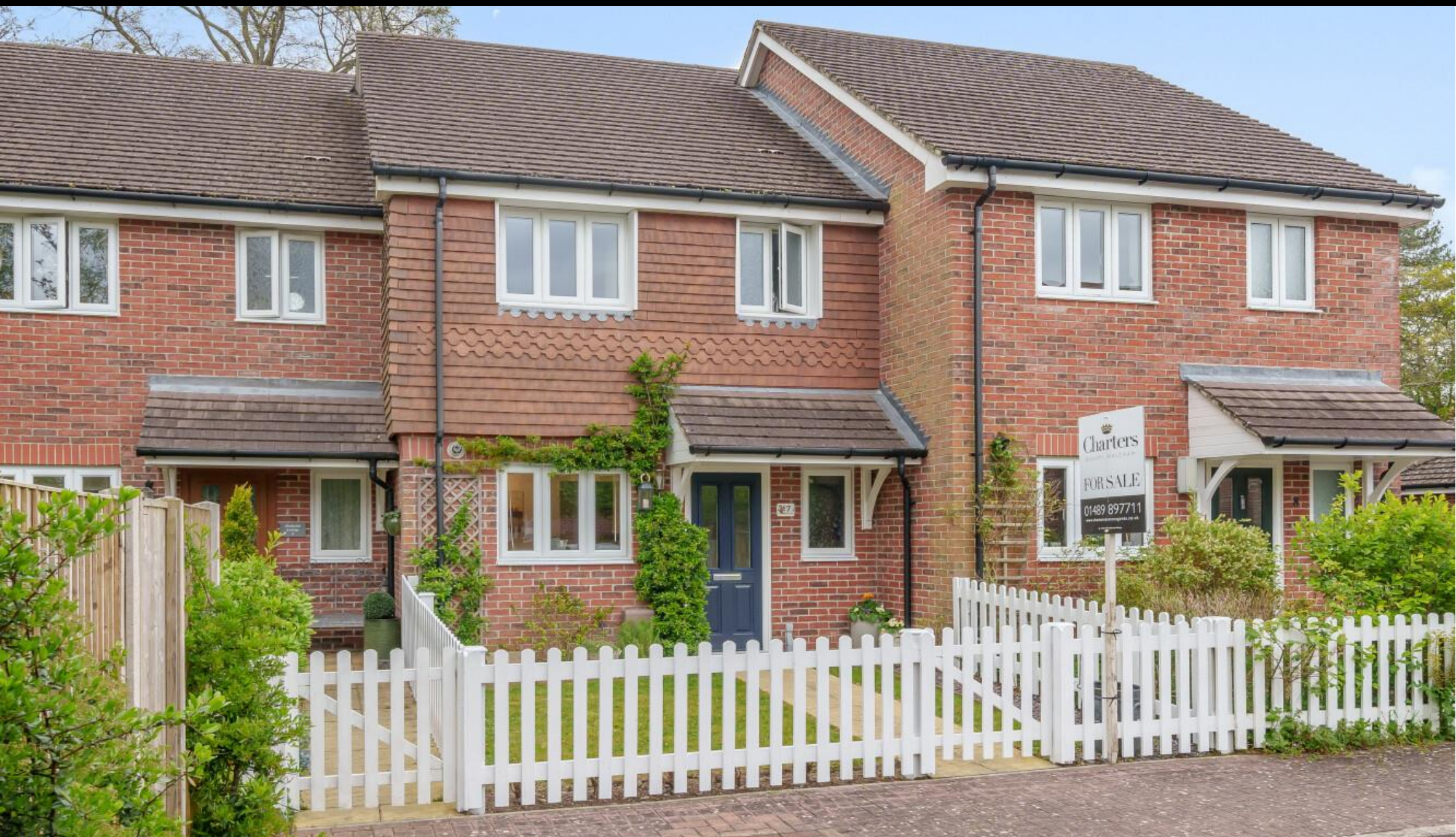
Edwards Close, Shedfield, Southampton, Hampshire, SO32 2HB