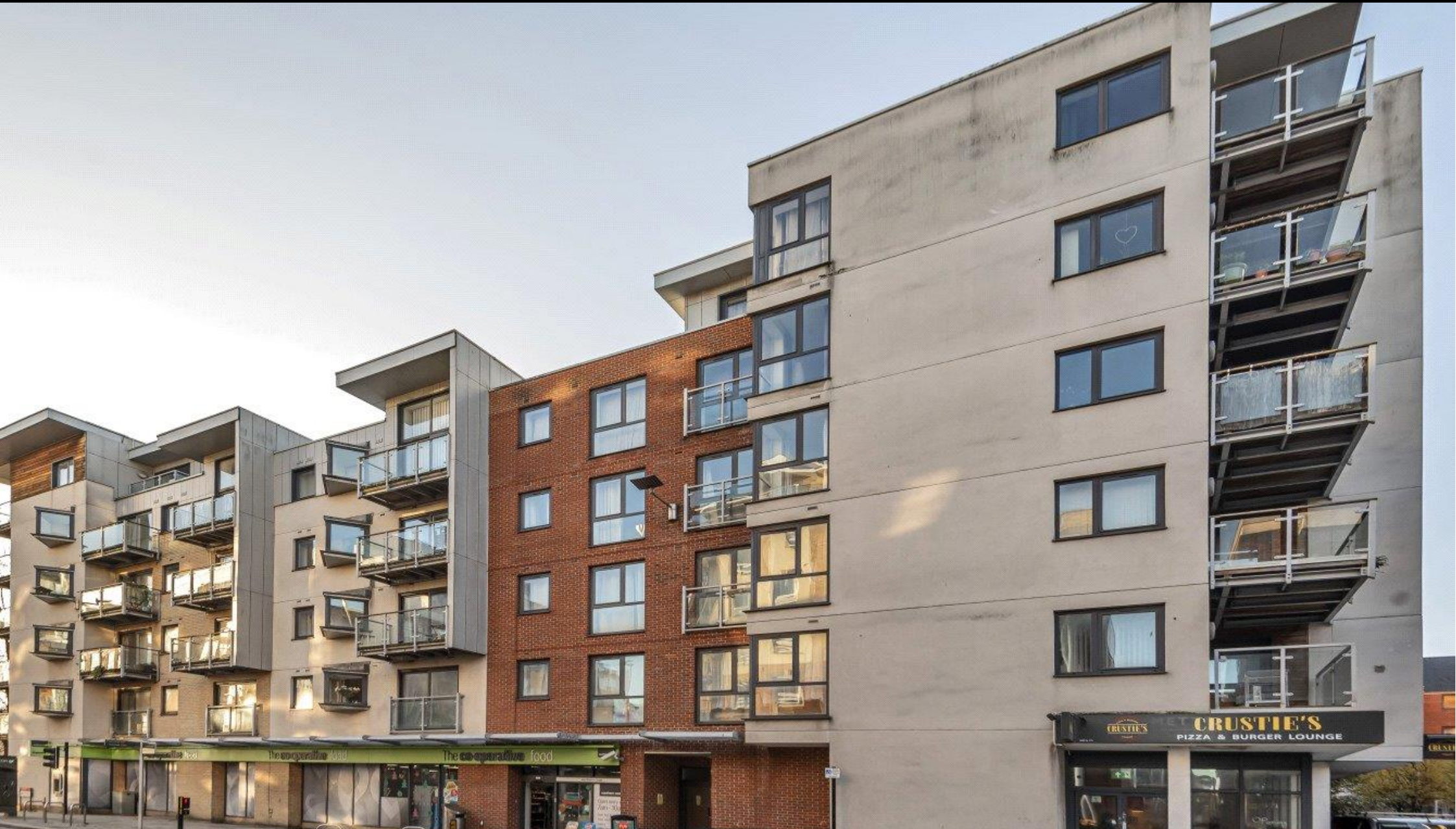
Castle Place, 117 High Street, Southampton, Hampshire, SO14 2EA