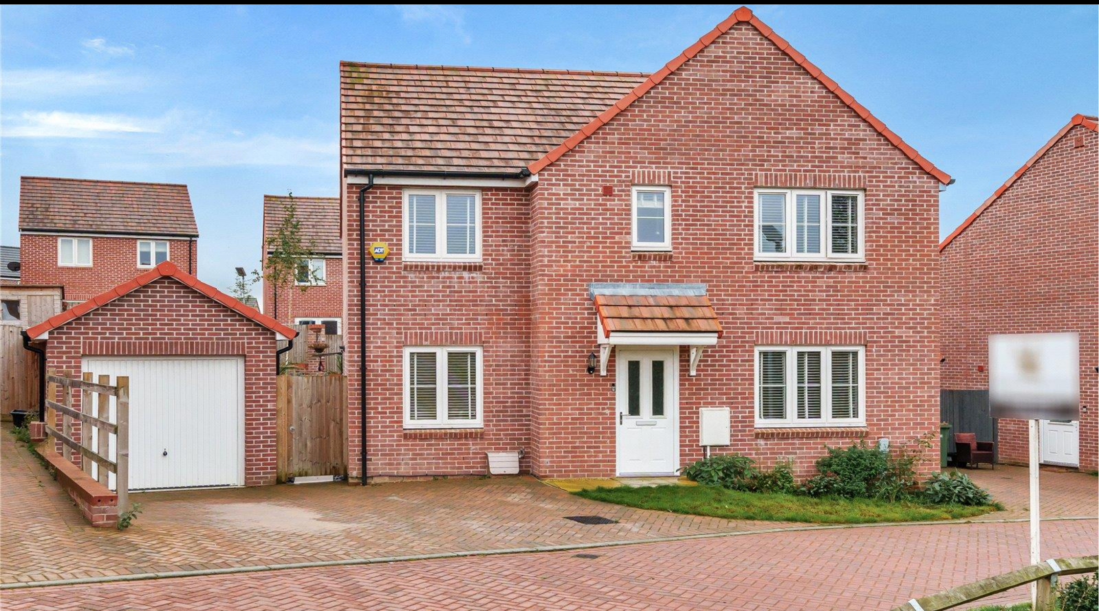
4 Holloway Mews, Fair Oak, Eastleigh, Hampshire, SO50 7HW