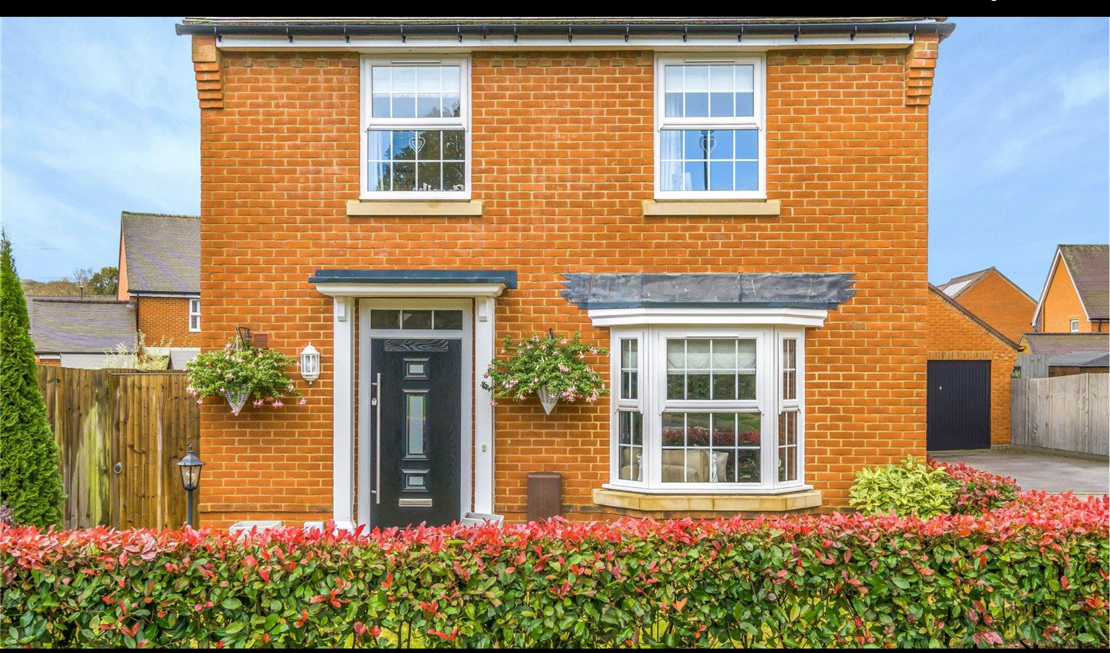
Holywell Close, Swanmore, Southampton, Hampshire, SO32 2FT