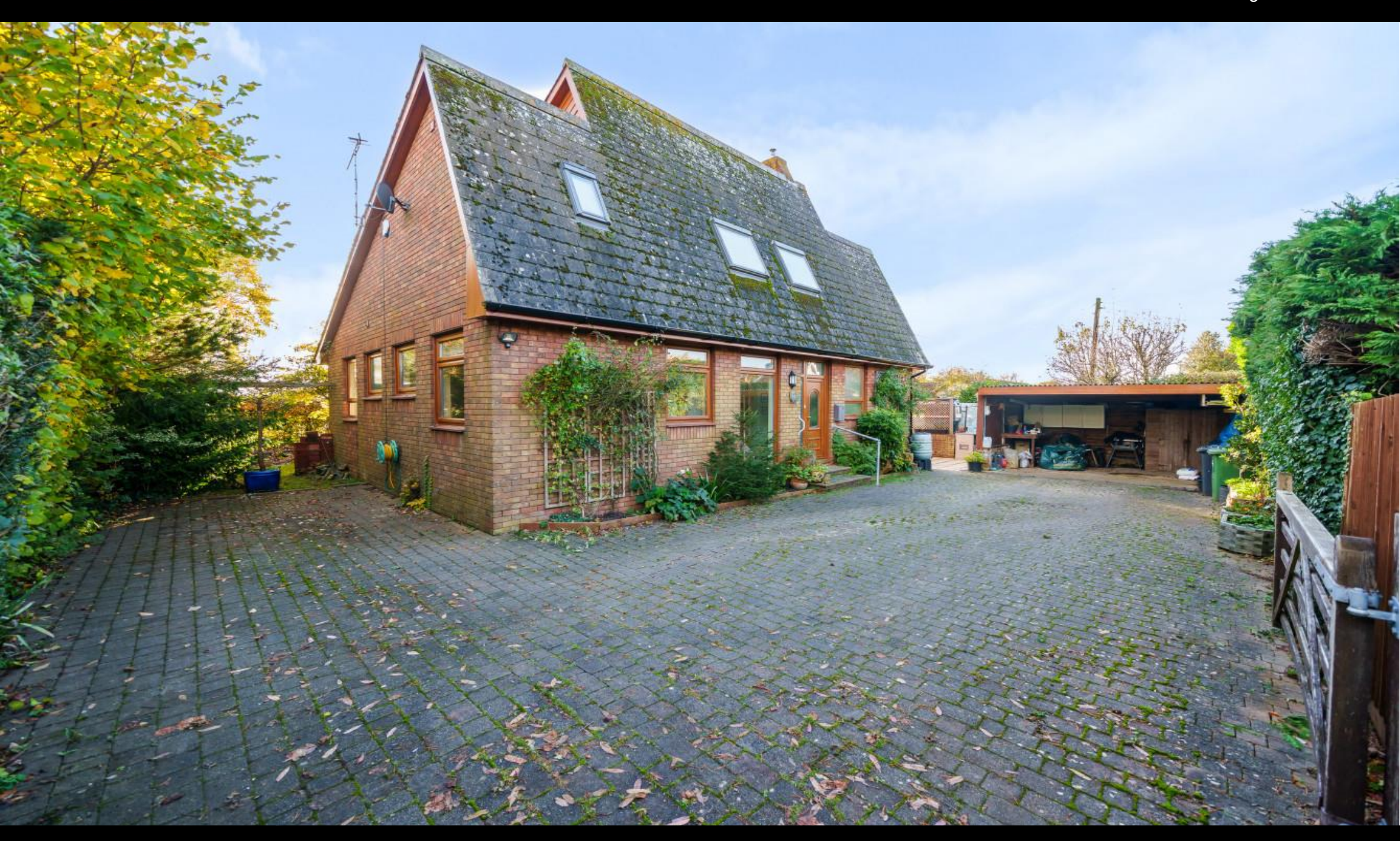
Lyeway Lane, Ropley, Alresford, Hampshire, SO24 0DW