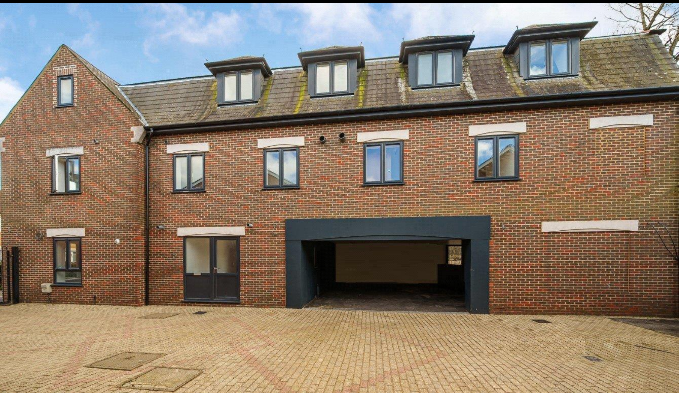
Normandy House, Nether Street, Alton, Hampshire, GU34 1EA