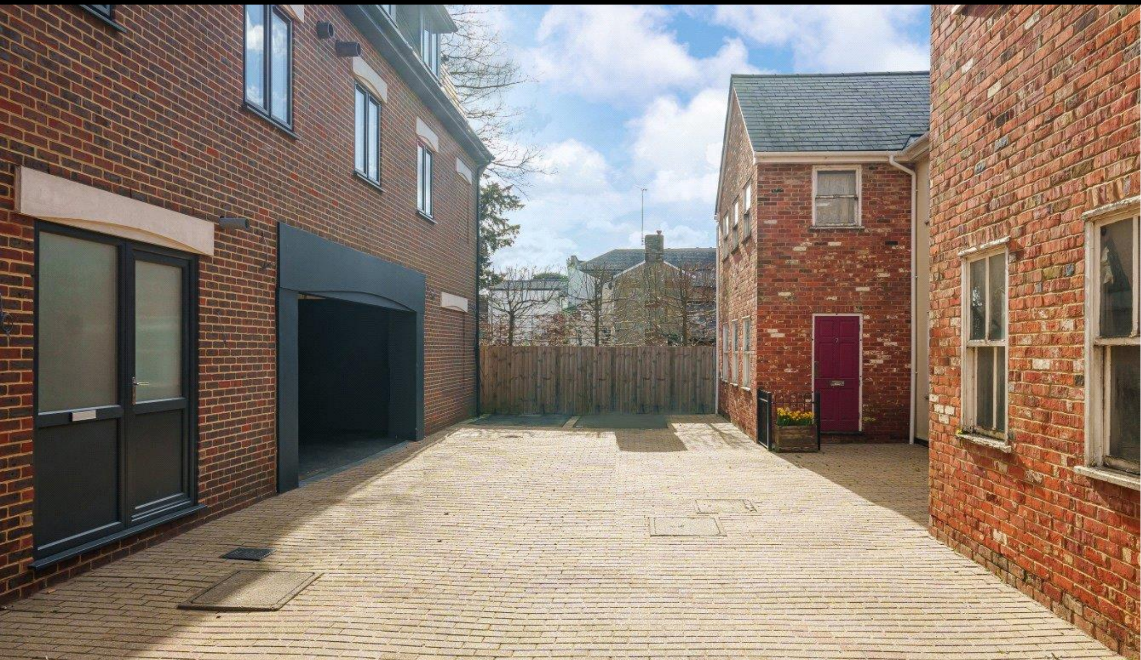
Normandy House, Nether Street, Alton, Hampshire, GU34 1EA