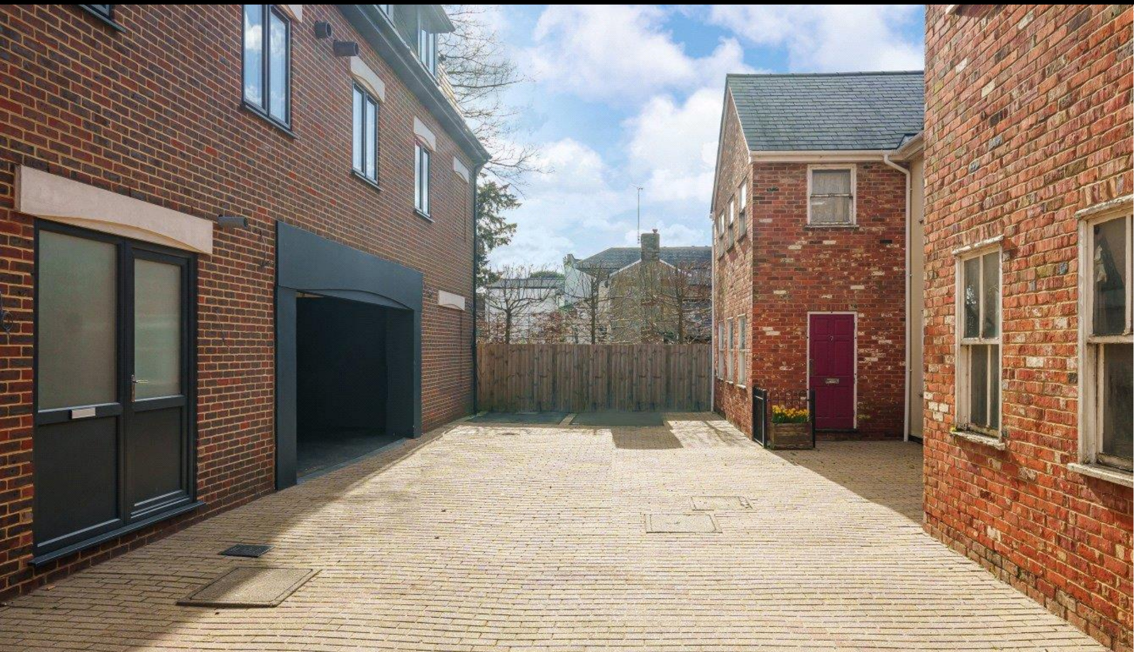
Normandy House, Nether Street, Alton, Hampshire, GU34 1EA