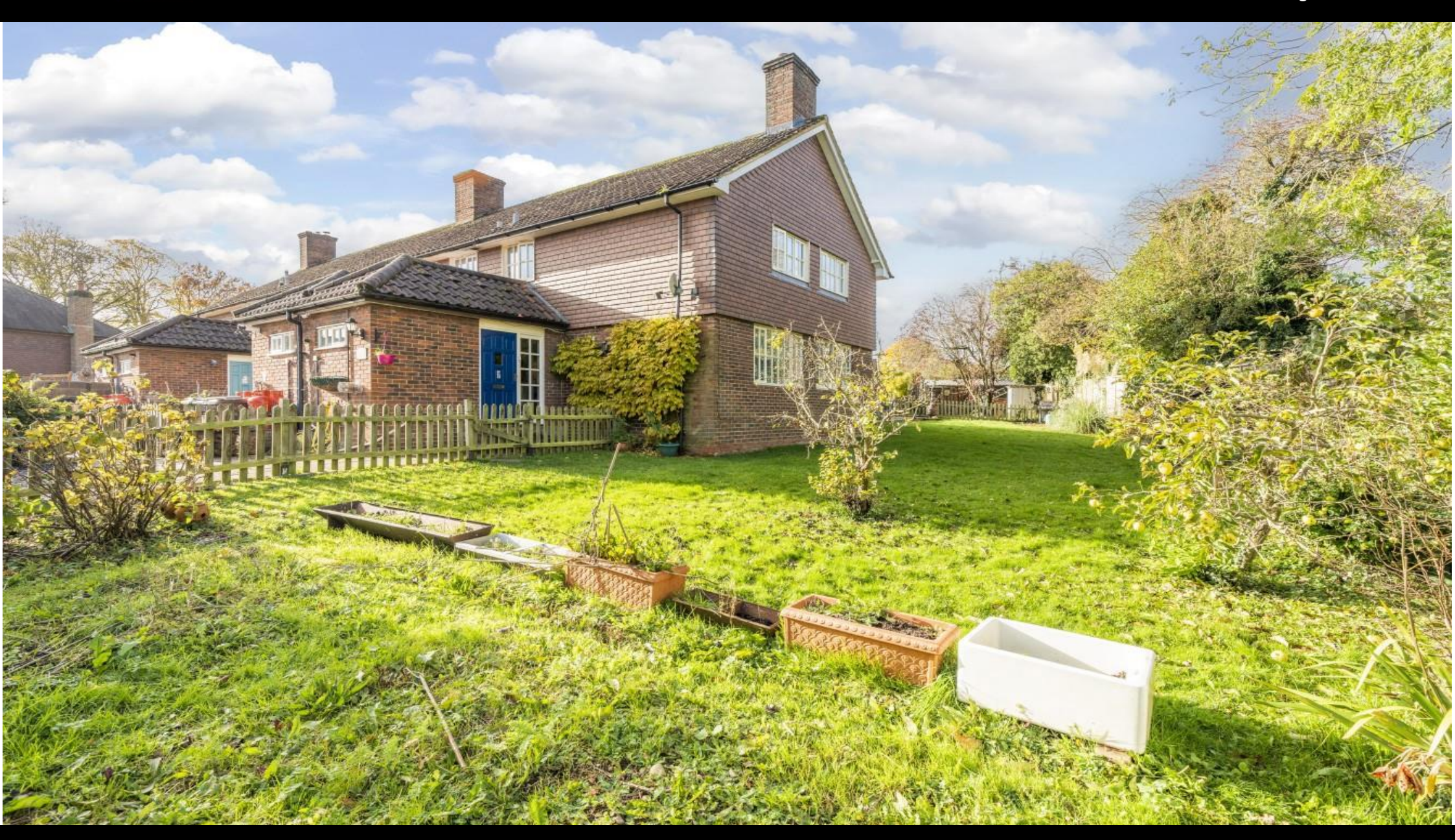
Pigeonhouse Yard, Sutton Scotney, Winchester, Hampshire, SO21 3JU