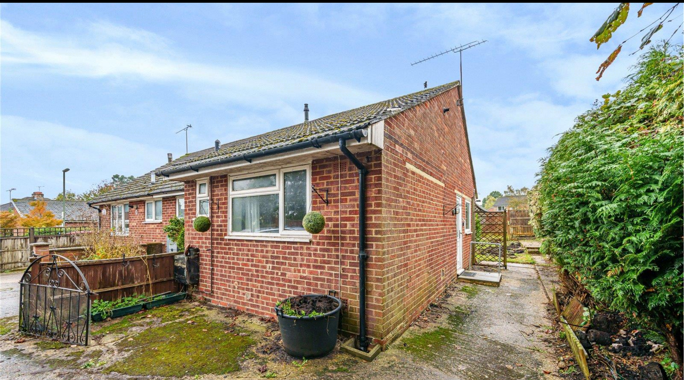
Rankine Close, Badshot Lea, Farnham, Surrey, GU9 9LA