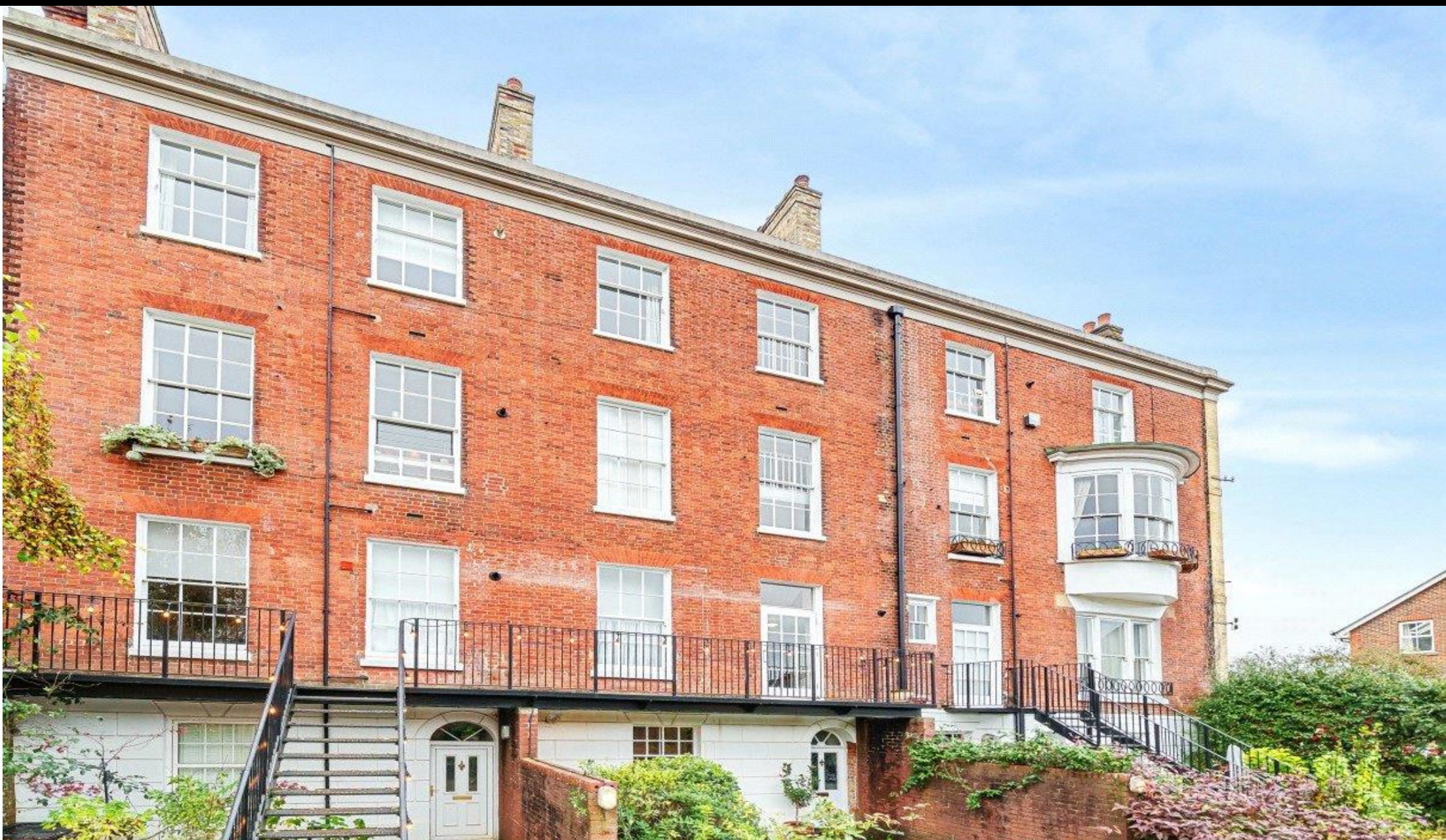
Princess Court, St. Peter Street, Winchester, Hampshire, SO23 8DN