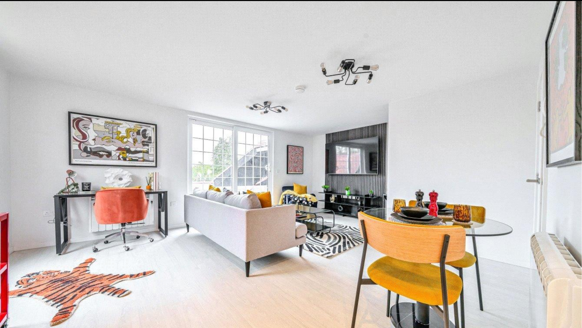
The Penthouse Collection, Elmfield West Block, 24 Millbrook Road East, Southampton, SO15 1HZ