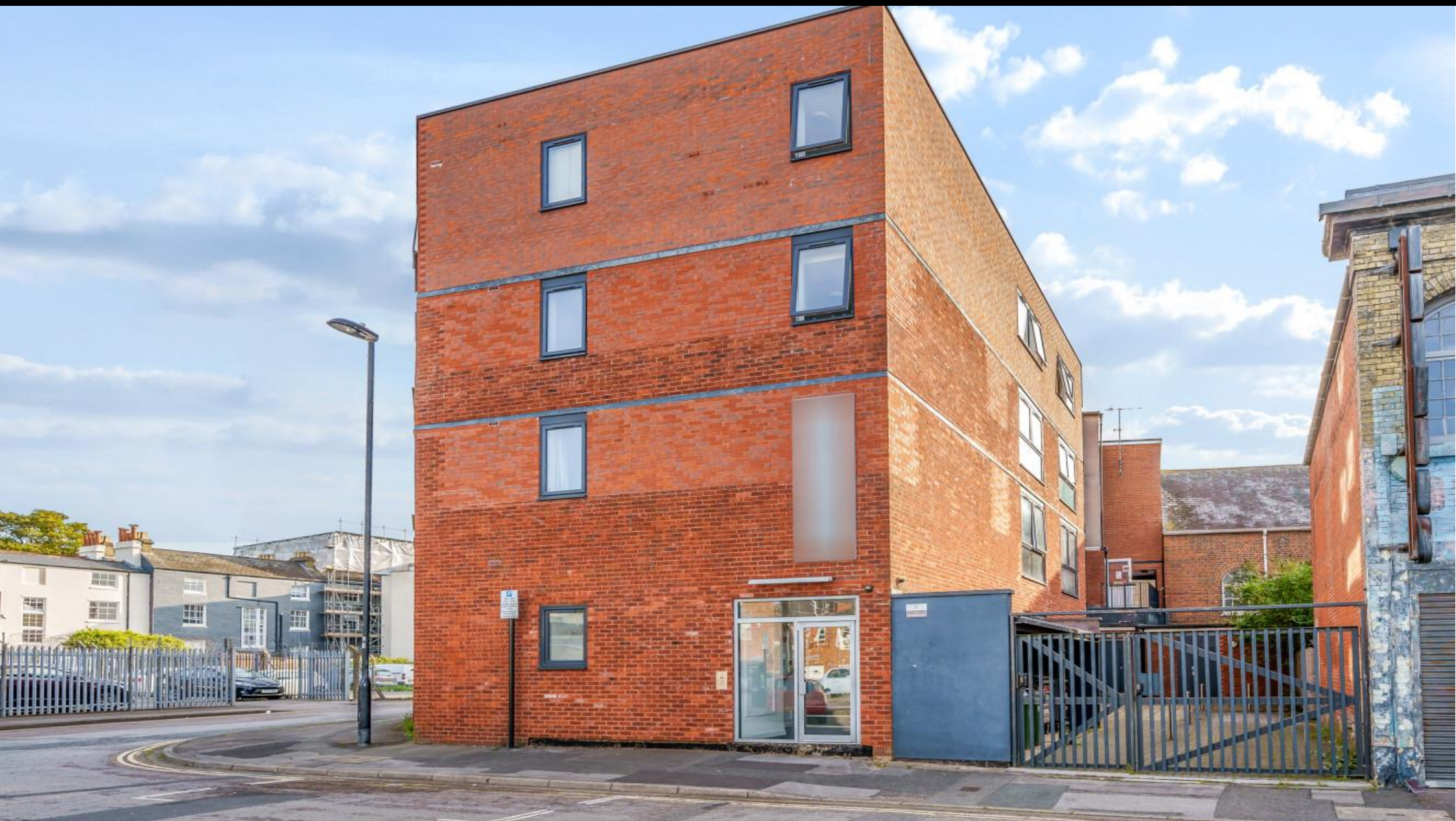
Lance House 16-18, Upper Banister Street, Southampton, Hampshire, SO15 2EF