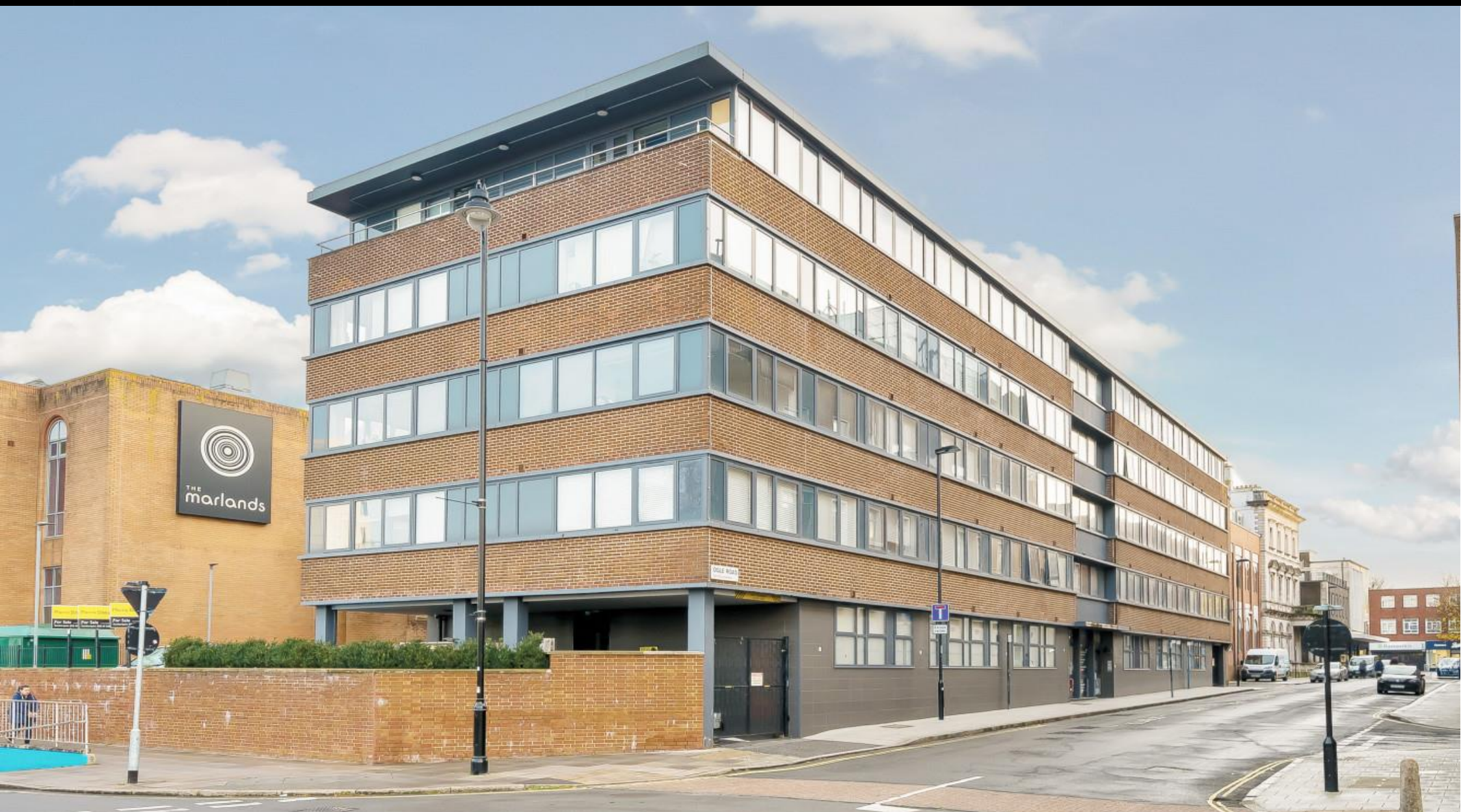
Portland Place, 8 Ogle Road, Southampton, Hampshire, SO14 7FB