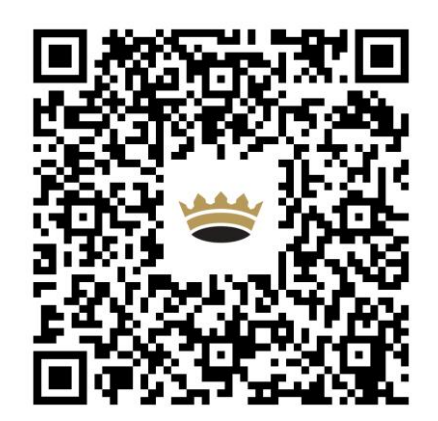
Scan the QR code to find out more information about this property.

Disclaimer Property Details: These particulars, whilst believed to be accurate are set out as a general outline only for guidance and do not constitute any part of an offer or contract. Intending purchasers should not rely on them as statements or representation of fact, but must satisfy themselves by inspection or otherwise as to their accuracy. We have not carried out a detailed survey nor tested the services, appliances and specific fittings. Room sizes should not be relied upon for carpets and furnishings. The measurements given are approximate. No person in this firms' employment has the authority to make or give any representation or warranty in respect of the property.