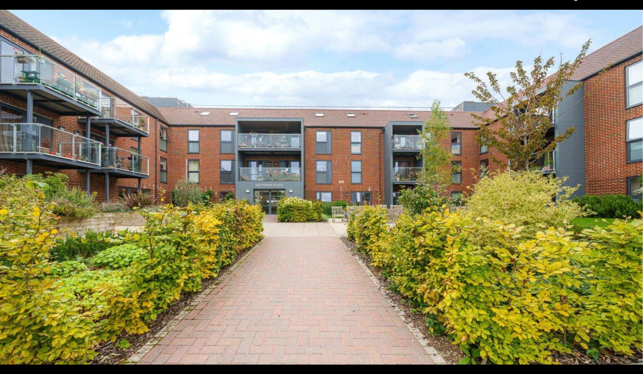
Wayfarer Place, The Dean, Alresford, Hampshire, SO24 9FT