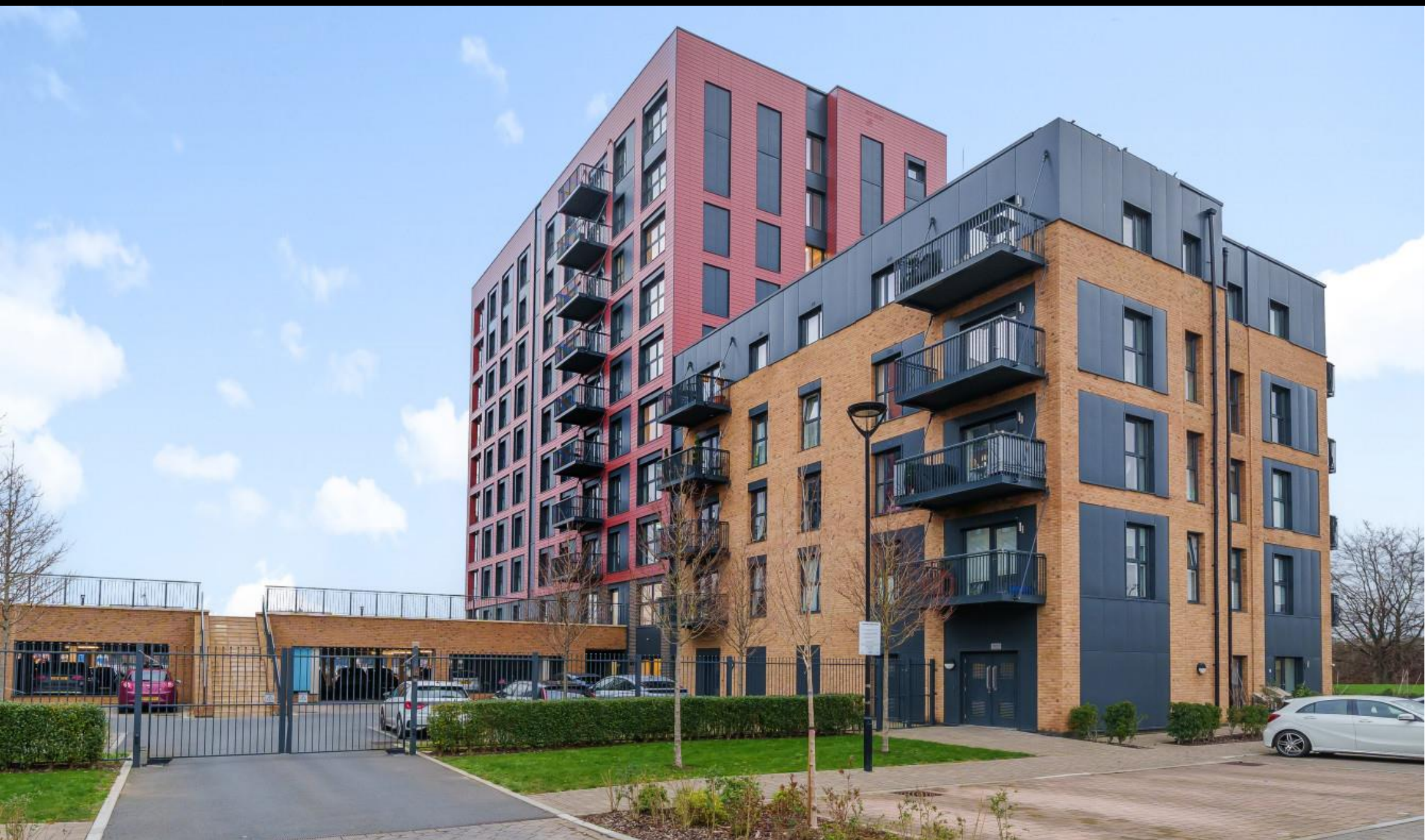
Television House, Meridian Way, Northam, Southampton, Hampshire, SO14 0FS