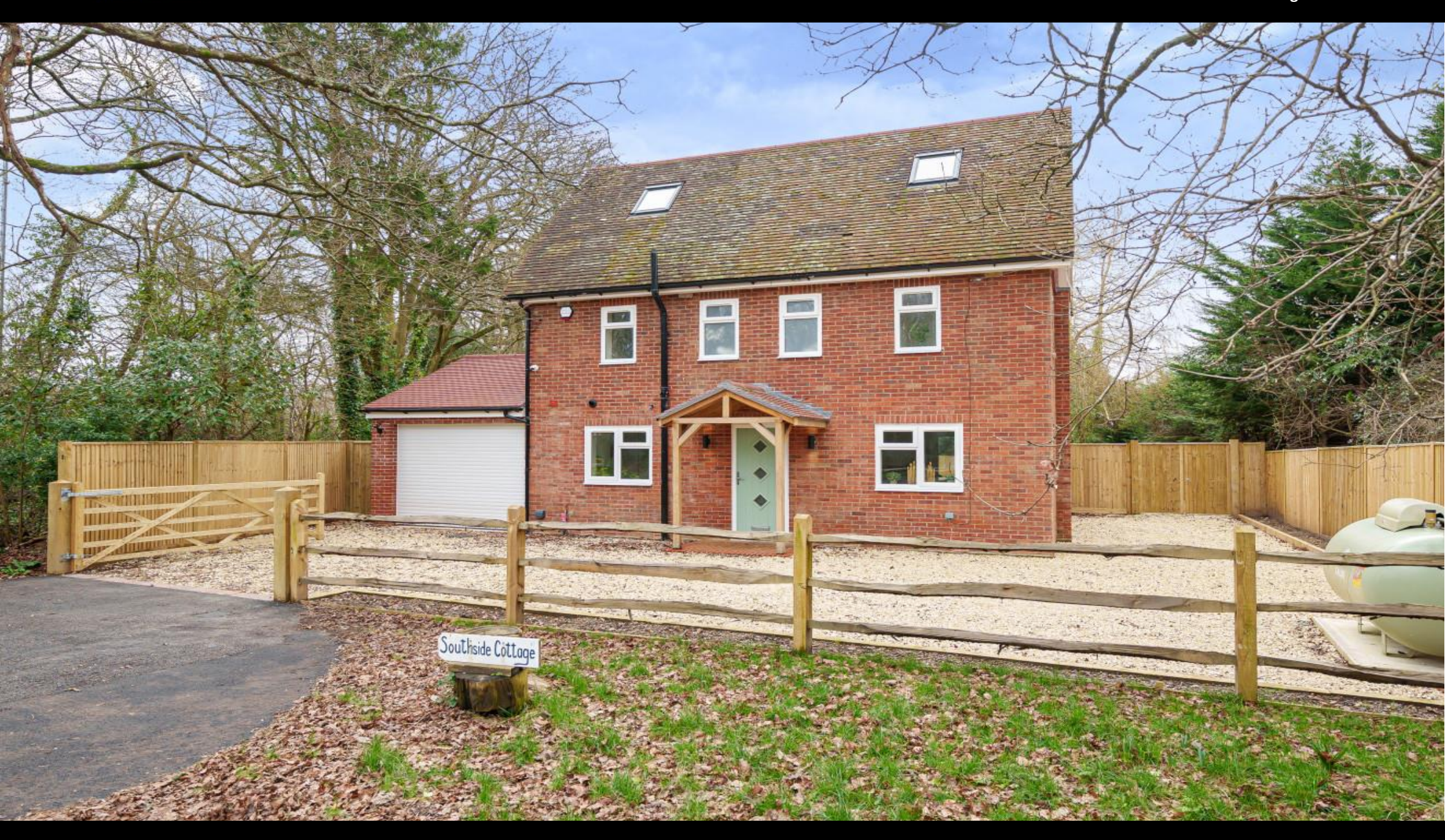
Botley Road, Shedfield, Southampton, Hampshire, SO32 2HN