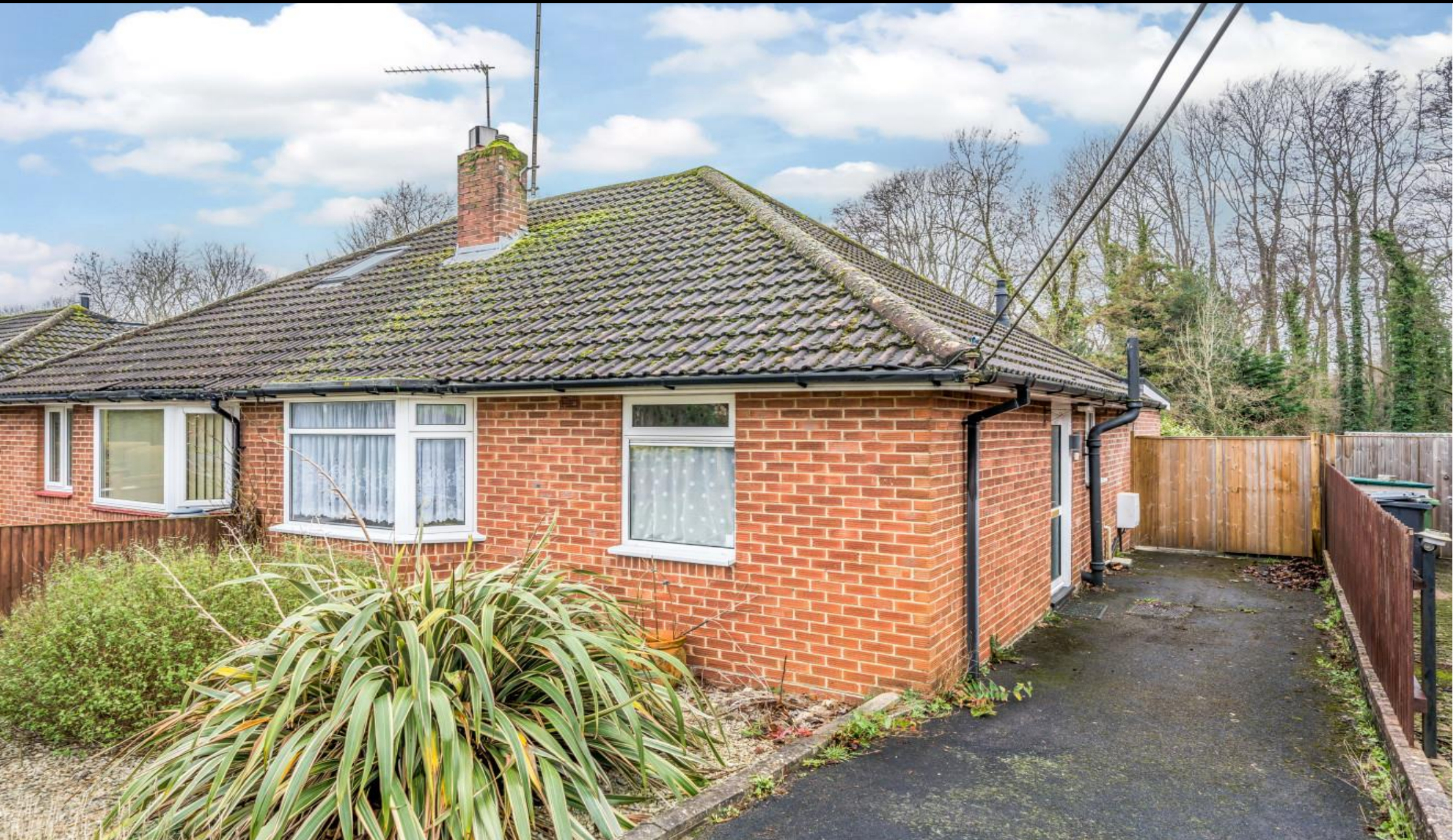
Boyatt Crescent, Allbrook, Hampshire, SO50 4LP