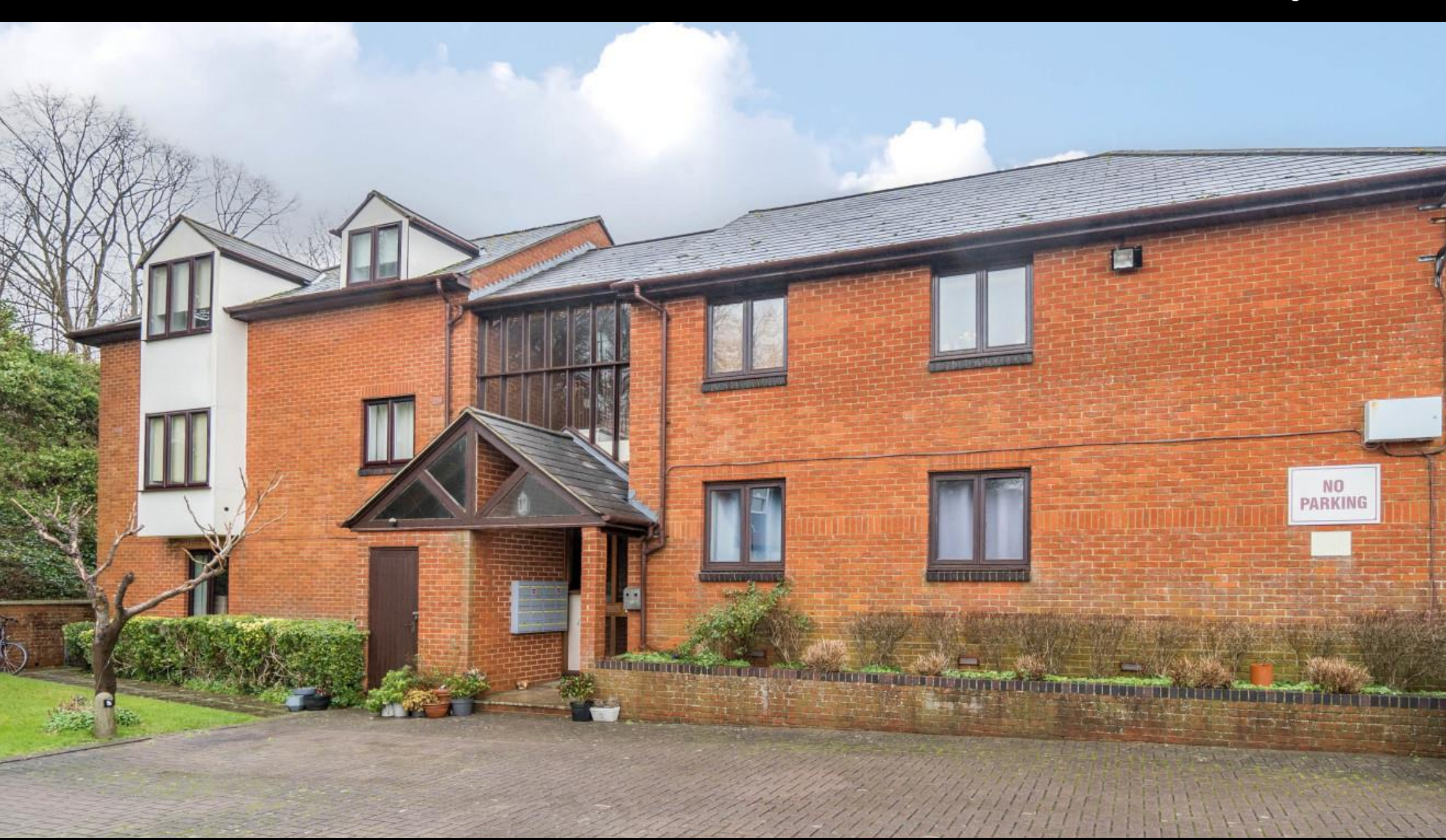
St. James Terrace, Farnham, Surrey, GU9 7LH