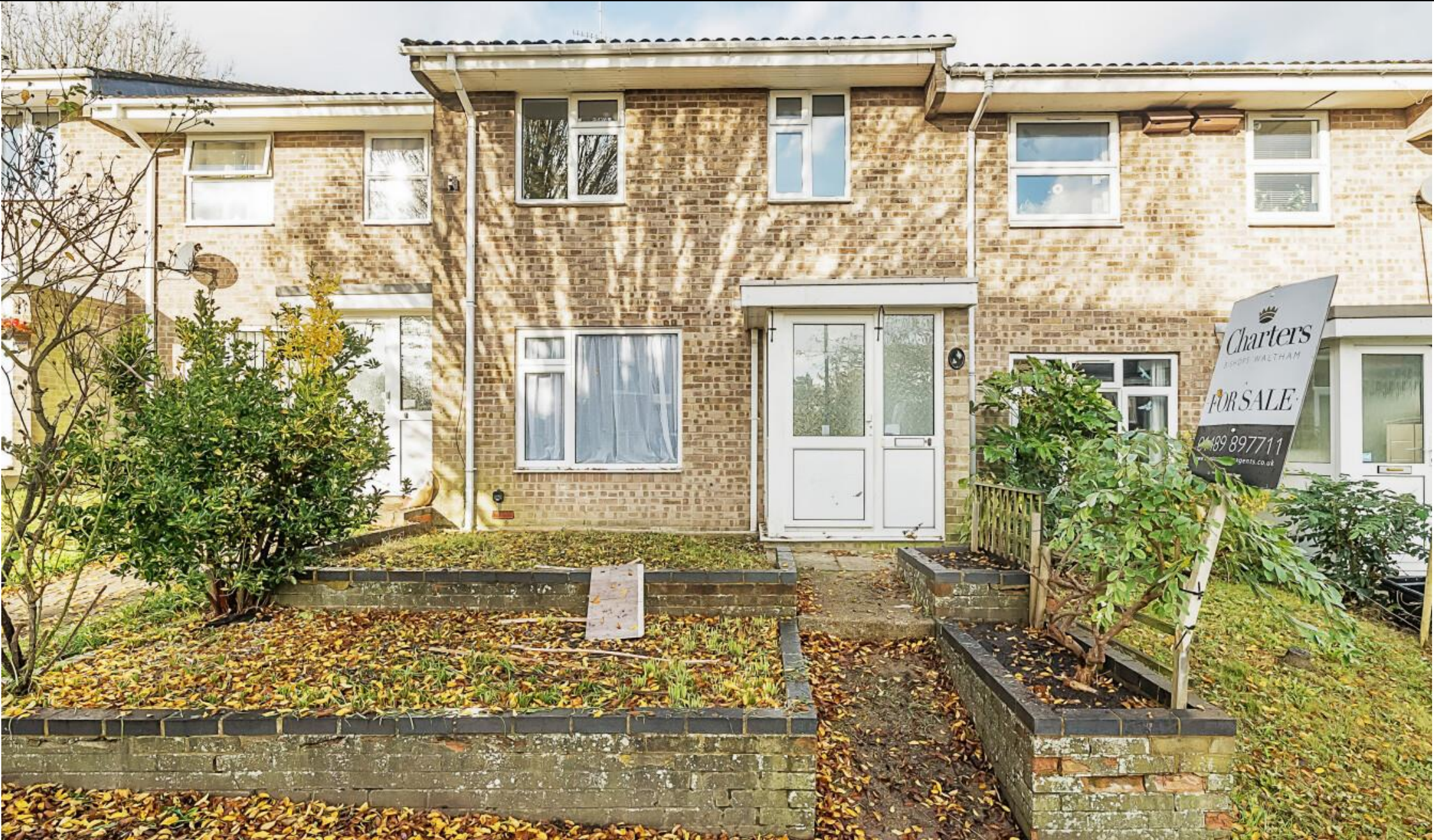
Greens Close, Bishops Waltham, Southampton, Hampshire, SO32 1JT