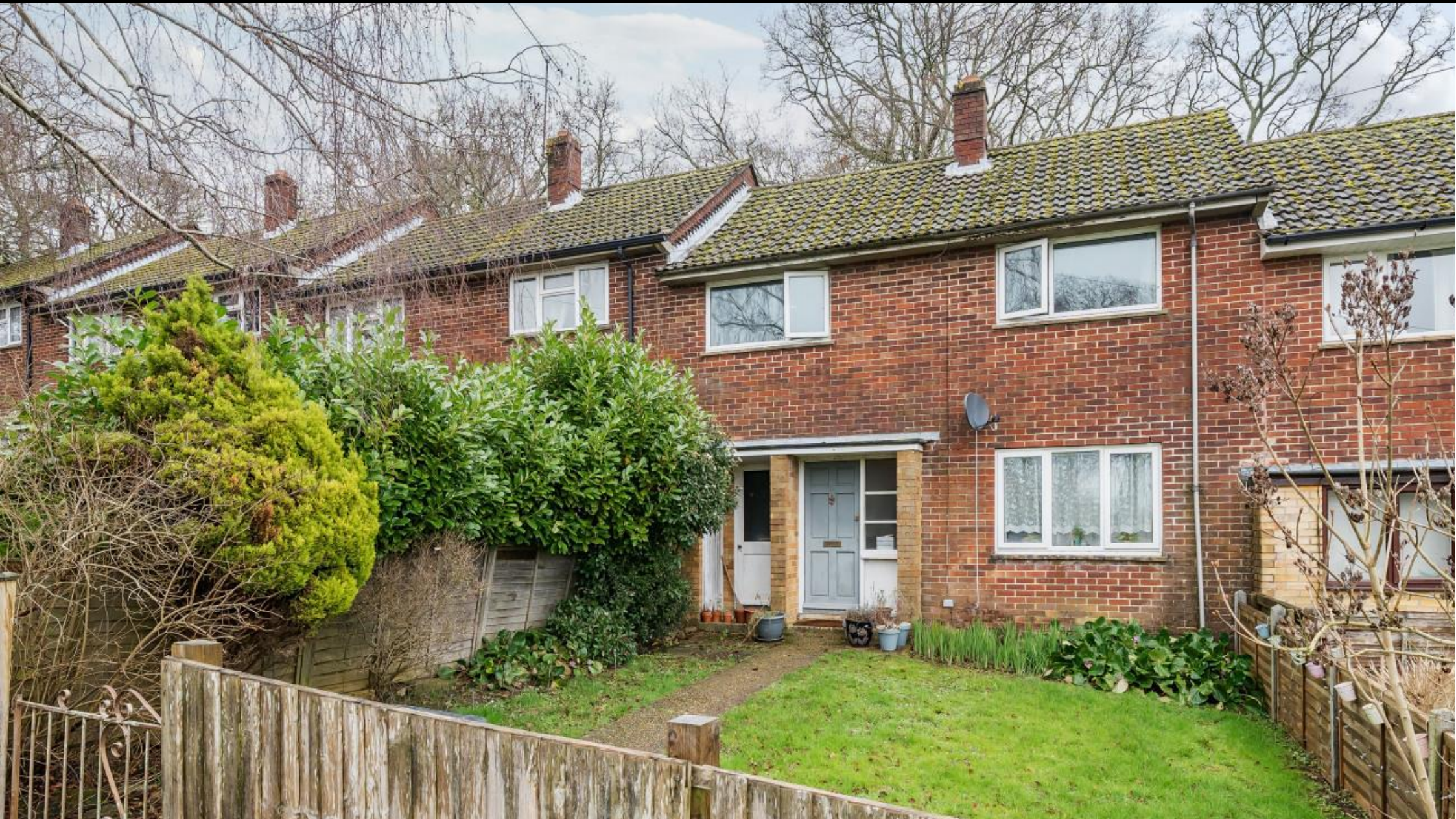
Battery Hill, Bishops Waltham, Southampton, Hampshire, SO32 1BT