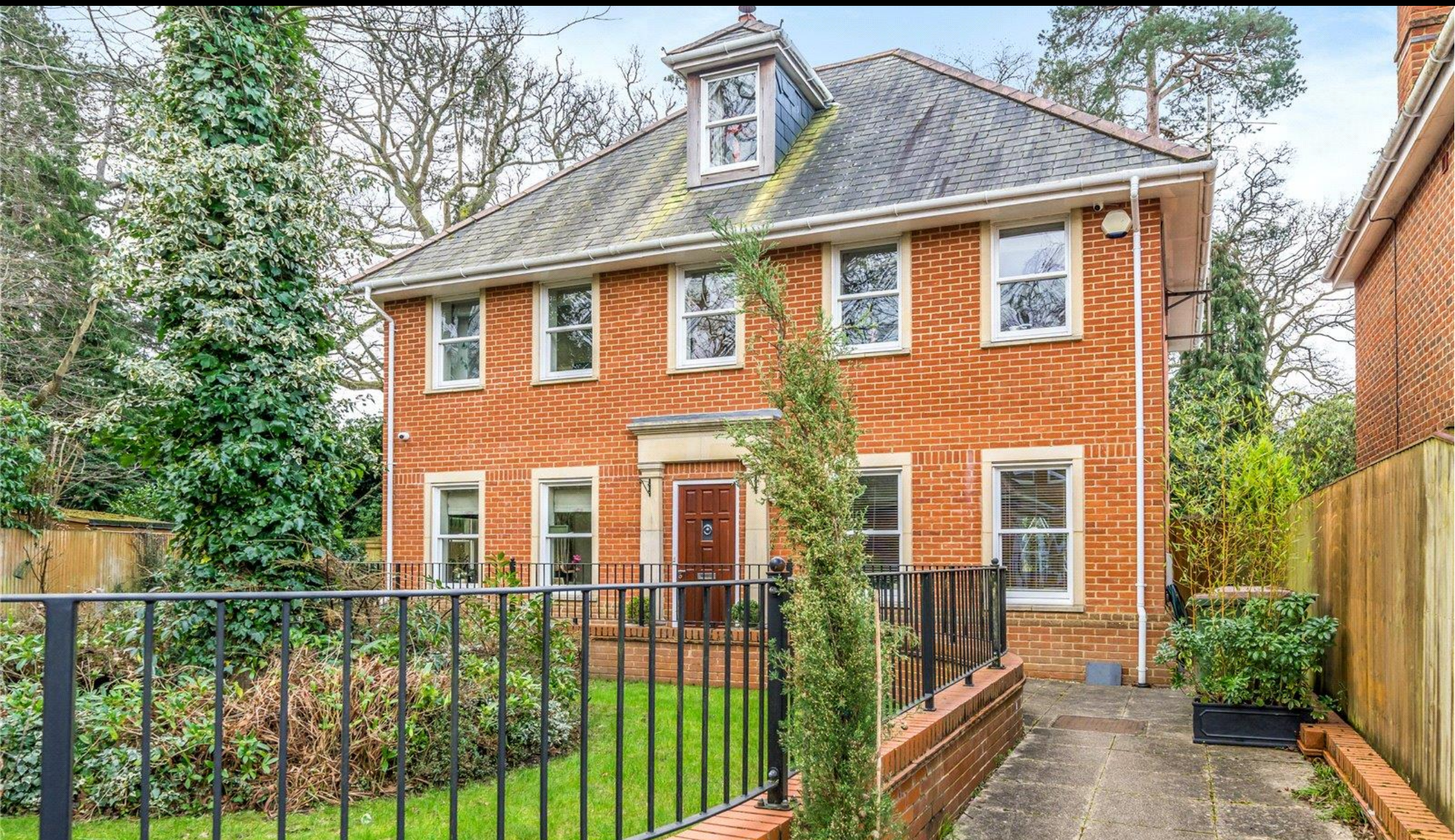
Cleek Drive, Bassett, Southampton, Hampshire, SO16 7PQ