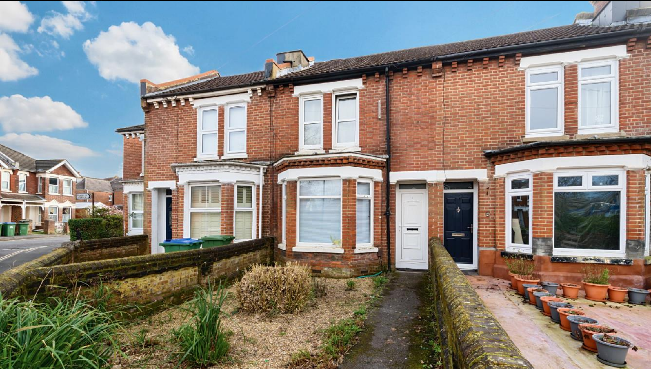
Handel Terrace, Polygon, Southampton, Hampshire, SO15 2FG