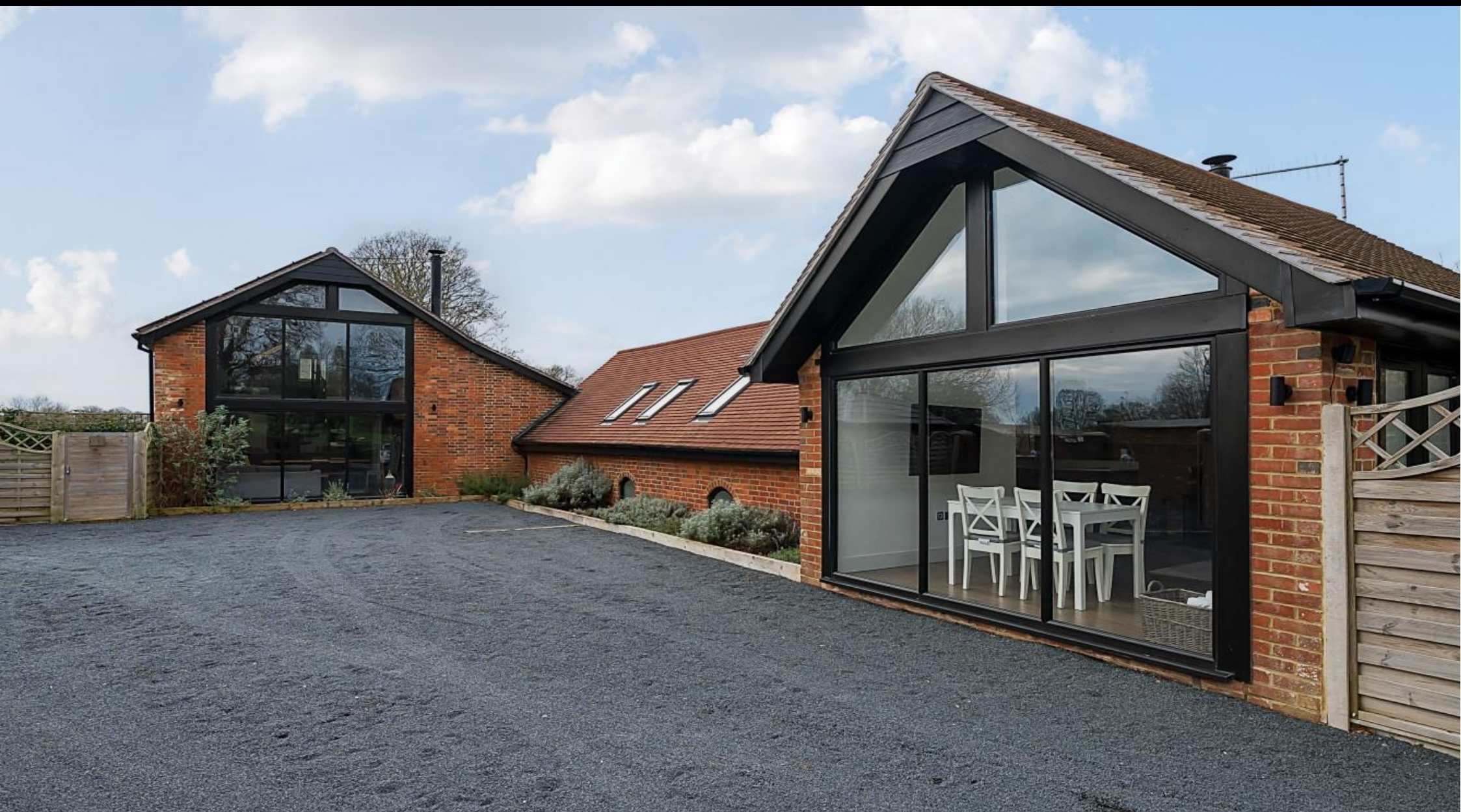
The Oaks Barns, Parsonage Lane, Durley, Southampton, Hampshire, SO32 2AD