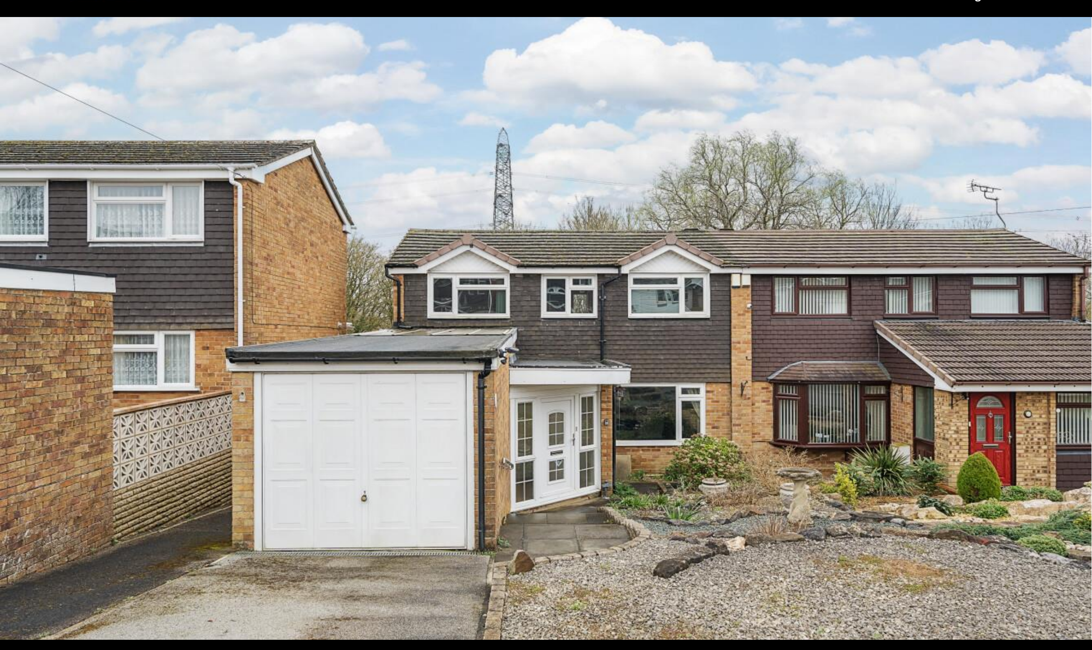
Westmorland Way, Chandler's Ford, Hampshire, SO53 2LA