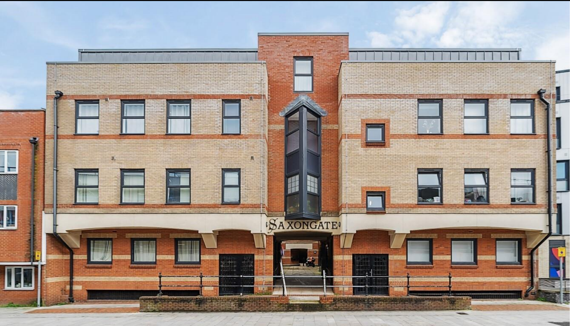
Saxon Gate, Back of the Walls, Southampton, Hampshire, SO14 3HA