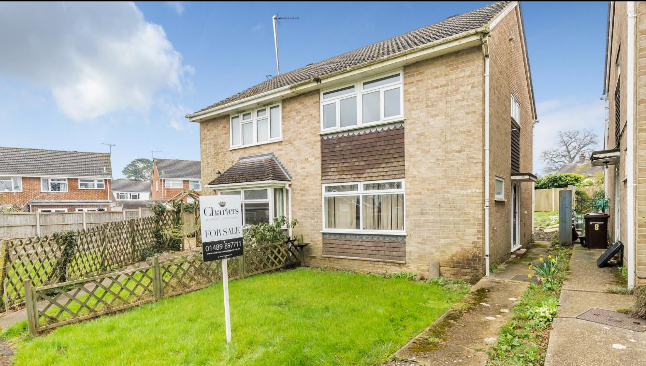
Meadow Gardens, Waltham Chase, Southampton, Hampshire, SO32 2NJ