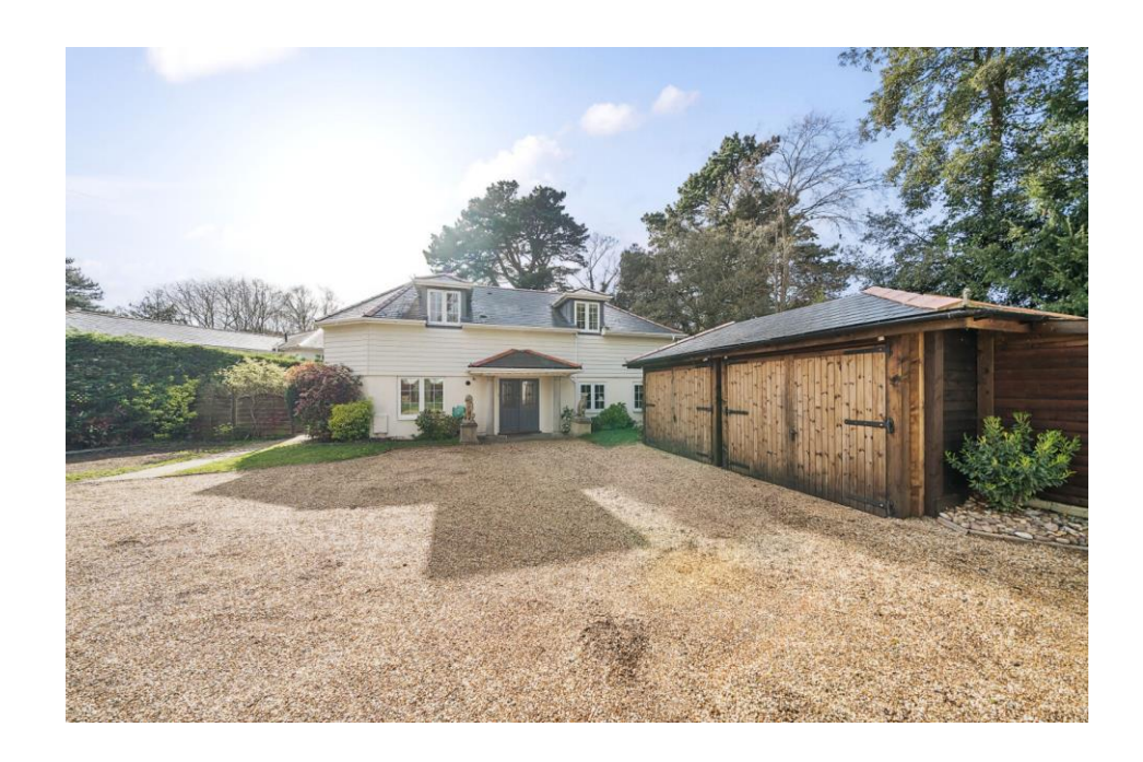
Picturesque views over the Solent • Three/Four Bedrooms • Substantial detached home • Double Garage • In & Out Driveway With Electric Gates • Stunning rear gardens

Set within an enviable plot headed toward the shoreline of Southampton Water this unique residence spans over 2500 sq.ft of accommodation and boasts exceptional views out over The Solent and beyond.