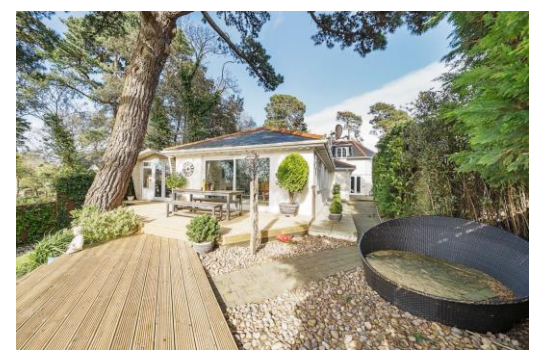
LOCAL AUTHORITY Fareham Borough Council Council Tax Band E