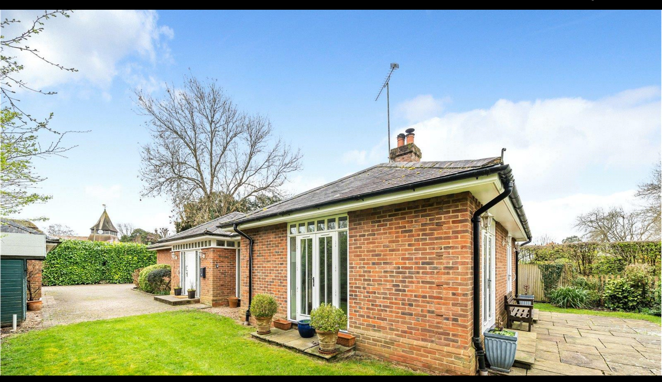
Old Iron Foundry, King's Somborne, Stockbridge, Hampshire, SO20 6RP